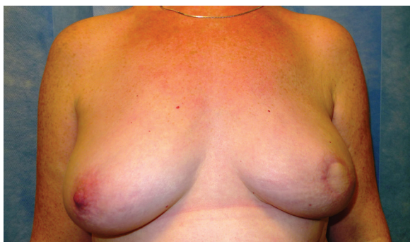
Fig. 10: Patient with Left autologous LD reconstruction prior to CC-V flap nipple reconstruction.

surgery and the patients were then advised to continue using the Lyofoam circles in their bra to continue protecting the reconstruction for the next 4 weeks.