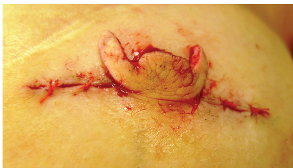
Fig. 6: Wings of C-V flap brought round to form a tube.

3/0PDS deep dermal sutures and the skin closed with interrupted 4/0 vicryl rapide. The lateral wings of the C-V flap were wrapped round to form the base and sutured in the standard way with 4/0 vicryl rapide as seen in Figure 6. The free dermal graft was then inserted into the tube formed by the two wings which was illustrated by Figure 7. The lid of the nipple reconstruction was then closed over the top of the graft and sutured into position. The final result was shown in Figure 8.