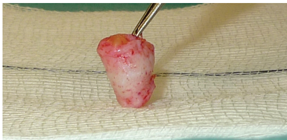
Fig. 4: Graft rolled up and secured in a roll.