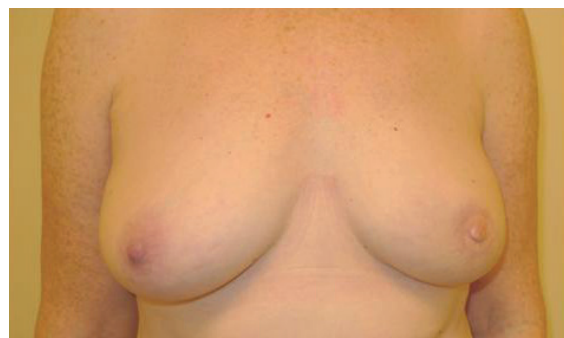
Fig. 11: Patient with Left autologous LD reconstruction after CC-V flap nipple reconstruction.

The average time since nipple reconstruction was 36.8 months (range=19-54 months). The majority of patients had undergone an autologous LD reconstruction (10/23), one had LD+ implant reconstruction, six had implant based reconstruction and one had an oncoplastic reconstruction of the breast following a central excision. There was one smoker in the cohort and five patients had undergone radiotherapy prior to nipple reconstruction. There were no immediate post-operative complications. Three patients reported no loss of projection. Of those that reported loss of projection one estimated it to be 25%, eight as 50%, four as 75% and 2 as 100% loss. The average score out of 10 for nipple projection was 4.6 (range=1-10). There was no association between previous radiotherapy and loss of projection. The average score for overall cosmetic appearance was 7.3 out of 10 (range=4-10). Thirteen of the fourteen patients felt the procedure had been worthwhile and had improved the overall appearance of their breast reconstruction.