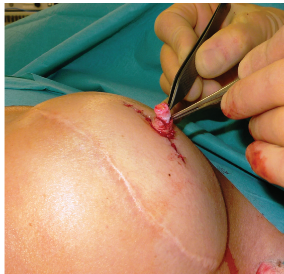
Fig. 7: Graft inserted into tube of C-V flap.

A protective dressing was important and kept in place for 2 weeks. Steristrips were applied to the linear wound. A loose piece of Jelonet with a split was laid over the nipple reconstruction. Two pieces of Lyofoam had a central hole cut into them and were placed