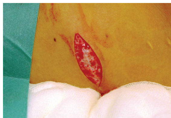
Fig. 1: Donor site.

3/0 monocryl interrupted deep dermal suture and a 4/0 monocryl sub-cuticular suture.