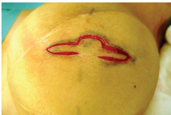
Fig. 5: C-V flap cut out of reconstructed breast skin.

3/0PDS deep dermal sutures and the skin closed with interrupted 4/0 vicryl rapide. The lateral wings of the C-V flap were wrapped round to form the base and sutured in the standard way with 4/0 vicryl rapide as seen in Figure 6. The free dermal graft was then inserted into the tube formed by the two wings which was illustrated by Figure 7. The lid of the nipple reconstruction was then closed over the top of the graft and sutured into position. The final result was shown in Figure 8.