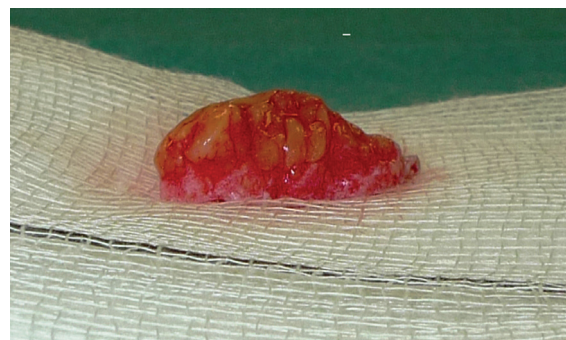
Fig. 2: Graft removed.

The graft was prepared by removing any subcutaneous fat with Strabismus scissors leaving a flap purely made of dermis. The graft size was adjusted as required. This could be seen in Figure 2 and 3. The flap was then rolled up like a cigar with the de-epithelialized side kept externally as illustrated in Figure 4. It was secured with two 4/0 vicryl rapide sutures. It was then returned to the saline until ready for use.