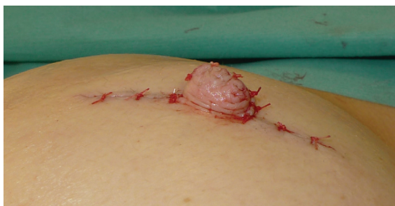
Fig. 8: Completed CC-V flap.

gently over the nipple reconstruction to protect it as seen in Figure 9. A waterproof dressing was then applied loosely over the top. Patient with left autologous LD reconstruction prior to CC-V flap nipple reconstruction was shown in Figure 10. Figure 11 demonstrates the patient with left autologous LD reconstruction after CC-V flap nipple reconstruction.