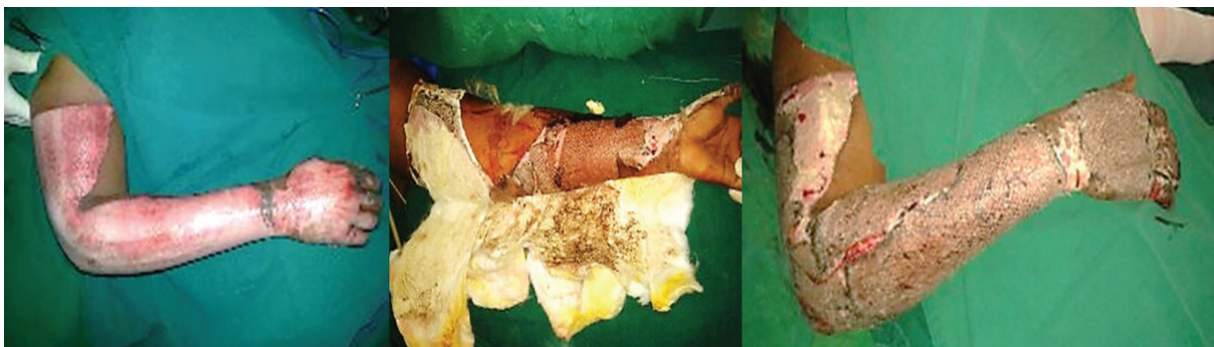
Fig. 9: A. Circumferential thermal burns- right upper limb. B and C. Third post-operative day after PRP application showing dryness of inner dressing and firmly adhered non-edematous skin graft.