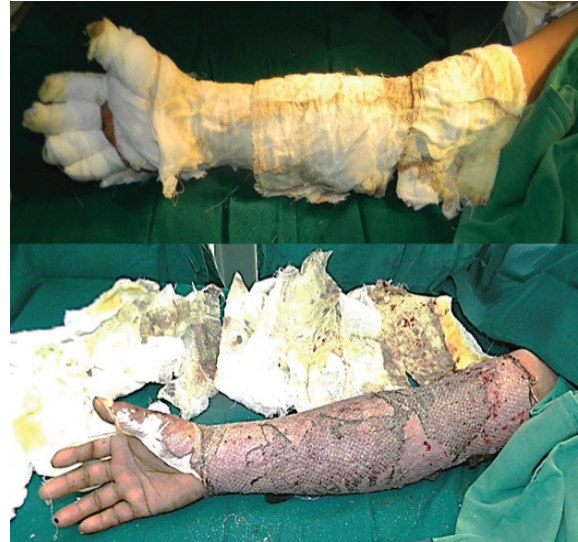
Fig. 11: A and B. First graft dressing on post-operative day-10 in post burn wound of right upper limb after use of PRP showing dry and non-edematous graft.