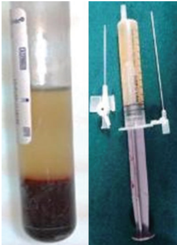
Fig. 1: A. Platelet rich supernatant plasma, buffy coat and red blood cells. B. Autologous PRP ready for use.

of skin graft to wound bed was confirmed by moving the graft on the bed with the finger which was done by assistants who were blind to the study (Figure 2). In the control group, sutures or staplers were used to secure the graft to the wound margins and bed. The graft was then covered with a non-adhesive mesh topped with betadine soaked cotton wool and secured with compression or tie over bolus dressings as indicated.