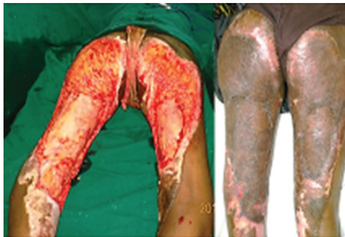
Fig. 6: A. 2 year old burn wound on posterior aspect of both thighs and gluteal region following tangential excision. B. 2 weeks post-operative period- well settled skin graft after PRP application.