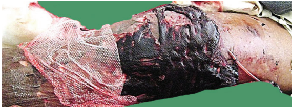
Fig. 10: First post-operative day-hematoma under the skin graft left knee and leg in control group.

of anti-platelet drugs (oral aspirin) were the relevant factors detrimental to graft take. PRP was beneficial in hypertensive patients and those who were on aspirin analogues in view of its hemostatic properties. In 94% of patients who underwent first graft inspection on the tenth day, grafts were found to be dry, non-edematous and firmly adherent including diabetic patients (Figures 11A and 11B).