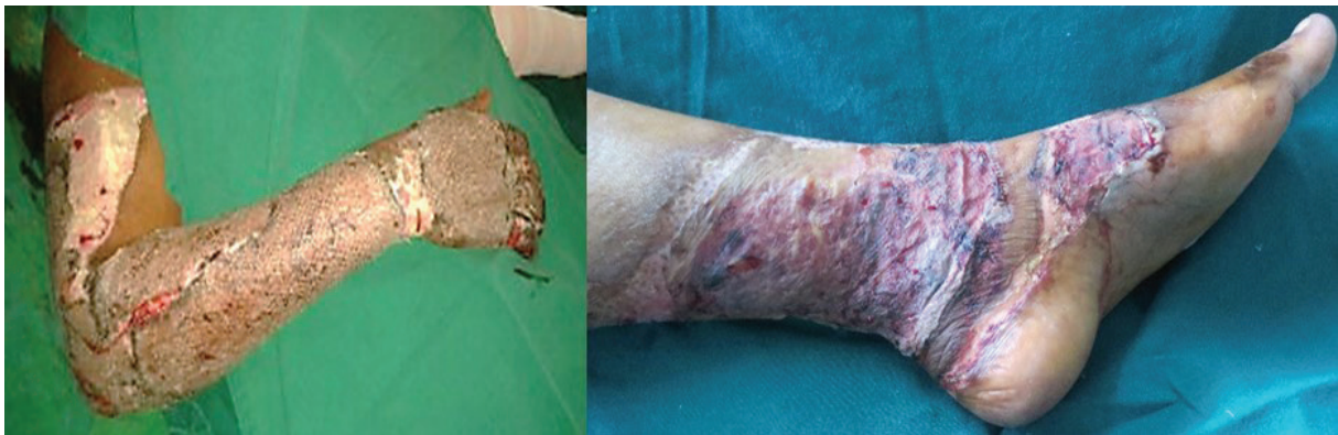
Fig. 8: A and B. Showing comparison of non-edematous and edematous skin grafts in PRP and control groups respectively on post-operative Day-3.

Only 4% of the patients in PRP group had hematoma under the graft and required secondary grafting compared to 15% in the control group (Figure 10). Diabetes, hypertension and intake