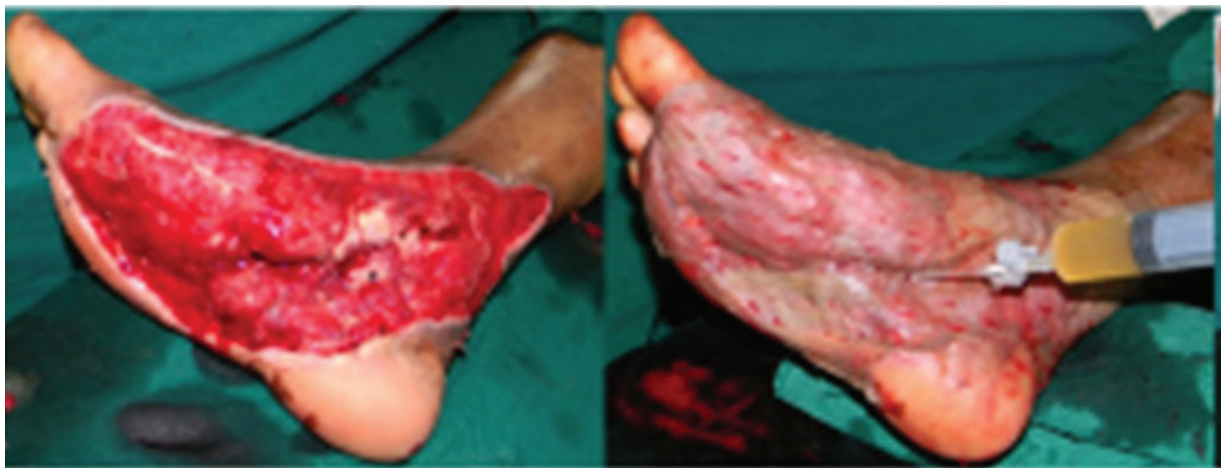
Fig. 5: A. Diabetic infection right foot: post-debridement status. B. PRP application.