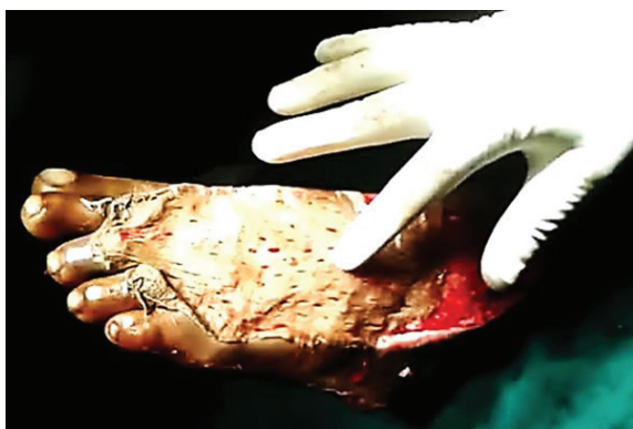
Fig. 2: Testing Instant adhesion of skin graft following PRP application by moving finger over the graft on dorsum of left foot.

Conventionally, first graft inspection is done in the early post-operative period i.e., within one week, but the indications of early