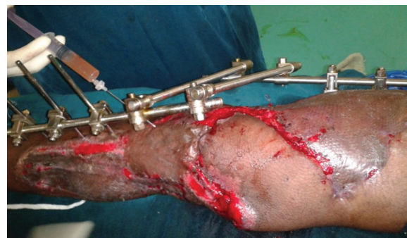
Fig. 13: PRP application under the flap in compound injury right leg.