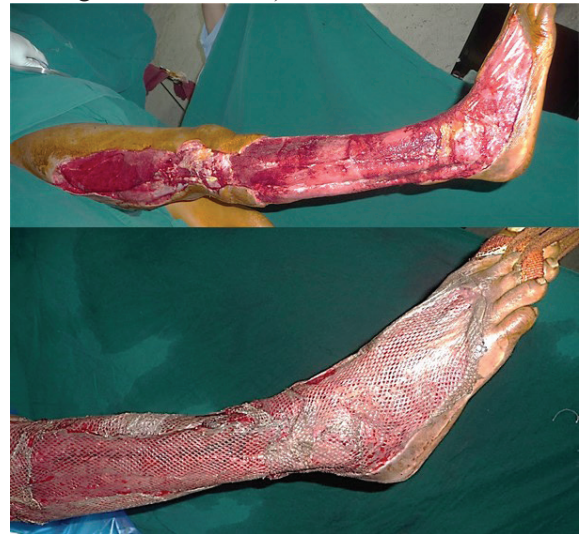
Fig. 4: A. Necrotising fasciitis right lower limb post-debridement status. B. PRP application under the graft.

wounds irrespective of the etiology yielded favorable results (Figures 3A and 3B, Figures 4A and 4B, Figures 5A and 5B, Figures 6A and 6B, Figures 7A and 7B).