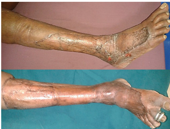
Fig. 12: A and B. 3 months post-operative: well settled scar with PRP application.

In our study higher percentage of scar hypertrophy was found in control group, but in PRP group, scar hypertrophy was not seen probably due to early adhesion, lesser incidence of graft oedema and collection under the graft (Figures 12A and 12B). Our experience on using PRP under full thickness skin grafts, flaps and split skin graft donor areas revealed favourable results (Figure 13, Figures 14A and 14B). The difference in all the objective parameters between controls and PRP groups were statistically significant ( P < 0.05 ).