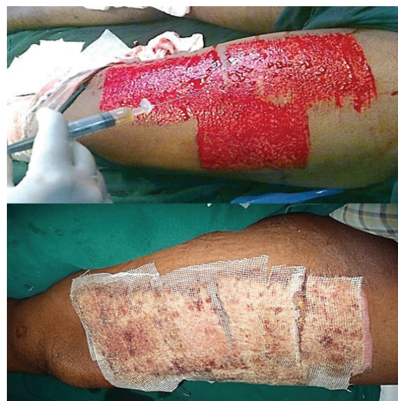
Fig. 14: A. PRP on skin graft donor area. B. Post-operative day-3. Wound dry.