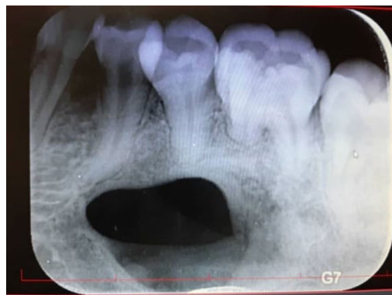
Figure 4: 1 year after of treatment, the patient shows remission of the periapical image