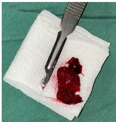
Figure 3: Macroscopic view of excisional biopsy