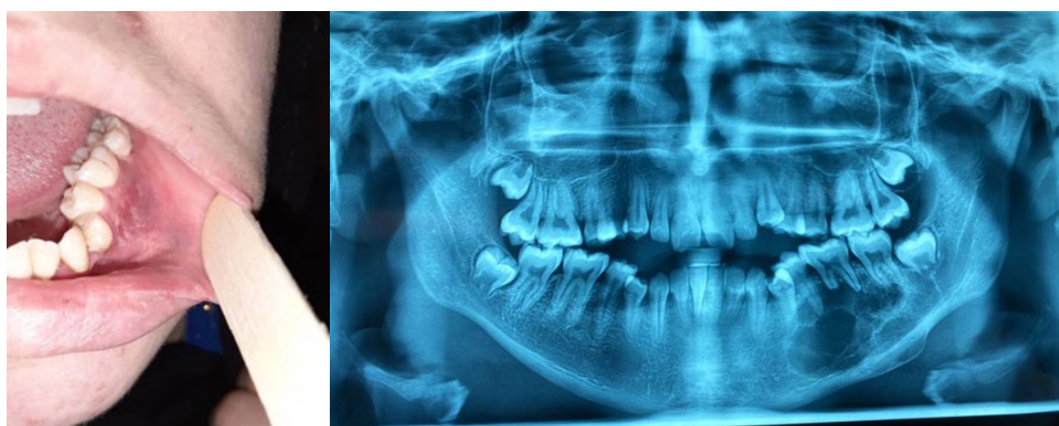
Figure 1: Clinical & panoramic view

A 17-year-old female patient presented with the main complaint of swelling on the left side of her face and the presence of purulent discharge in her mouth to the Department of Maxillofacial Surgery, Mashhad Dental School, Mashhad, Iran in July 2021 (Fig. 1). The swelling, located in the left mandibular angle (having started six months prior), was reported by the patient to have initially been small, gradually increasing in size, causing no functional impairment. The patient denied any associated pain or fever. The swelling was accompanied by purulent mouth discharge (without extraoral fistula). There was no history of trauma, hospitalization, surgical operation, radiotherapy, bisphosphonate use, specific drug use (excluding antidepressants and antihistamines), alcohol or smoking consumption, or tooth extraction. Family history did not indicate any genetic or hereditary diseases. Tenderness was present on palpation, but there were no extraoral fistulas, proptosis, nasal obstruction, or lymphadenopathy. Firm consistency of the lesion was noted, with no signs of inflammation (absence of erythema, warmth, or spontaneous pain). Moderate expansion was visible intraorally in the