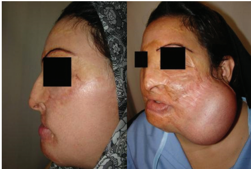
Fig. 6: The second patient before operation (Right) and after operation (Left).

expanders might increase the options for flap design. 20 Rectangular shaped prosthesis was used in the majority of the patients in this study (73.81%). Motamed et al. in another study showed that rectangular prostheses were used in 58.82% of the cases. 24