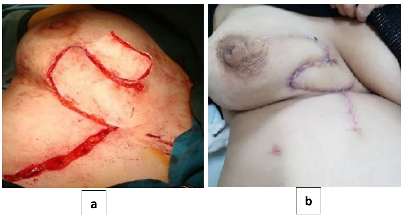
Figure 3: Reconstruction of the middle-medial defect. two adjacent(bi-lobbed) transposition flaps(a) one month after the operation(b)

After the surgery, we assessed the possible complications, such as infection in the surgery site, flap ischemia or necrosis, seroma, and hematoma. We discharged the patient with a drain one day after the operation. Before discharging the patients, we instructed the patients concerning how to dress the wound, evacuate, and chart the drain secretion. We used regular traditional Gauze dressing in all cases. A week after discharging the patients, we remove the drain if there is no secretion. Then we referred the patients to the oncologist with their tumor pathology report. All the patients are visited a month later, after finishing the radiotherapy course, and one year after the operation. We examined and evaluated the operation site and the flap in terms of aesthetics, possible side effects, local recurrence,