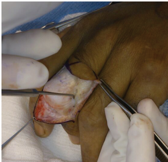
Fig. 5: The transverse retinacular ligament on the left.

Two lateral bands on each digit arise proximal to the PIP from the Extensor Digitorum Communis (EDC). The lateral bands travel on either side of proximal phalanx, and continue around the lateral aspect of PIP joints and finally both slips join together in a triangular aponeurosis to form the extensor tendon to the digital phalanx. The lateral bands are also formed from the deep head of the dorsal interossei combining with the volar interossei. They insert onto the base of the distal phalanx to extend the DIP joint. 9