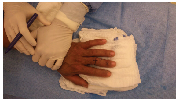
Fig. 2: Lazy S marking over the PIP joint.