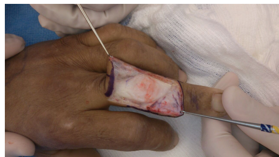
Fig. 3: The flaps are raised and reflected.