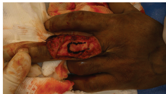
Fig. 7: Marking of the central slip with methylene blue dye.

However if an extensor lag of more than 20 degrees is still evident after stage II, Curtis advocated proceeding directly to stage IV. The central slip is dissected free (Figure 7) and advanced about 4 to 6 mm into a drill hole in the dorsal base of the middle phalanx (Figure 8). The lateral bands, which are no longer tight are loosely sutured to the central tendon. 9