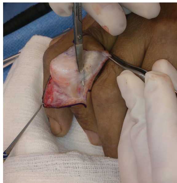
Fig. 4: The transverse retinacular ligament on the right.