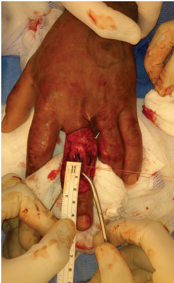
Fig. 8: The central slip is raised and advanced 4-6mm into drill hole of dorsal base of middle phalanx.