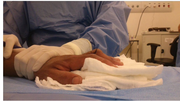
Fig. 1: Lateral view of Boutonniere's deformity of left middle finger.

Stage I entails a lazy "S" incision made over the PIP joint (Figure 2 and 3). The transverse retinacular ligament is located and mobilized in both the distal and proximal aspects (Figure 4 and 5). The transverse retinacular ligament originates from the flexor tendon sheath in the PIP joint and inserts on the lateral edges of the conjoined lateral bands. 9