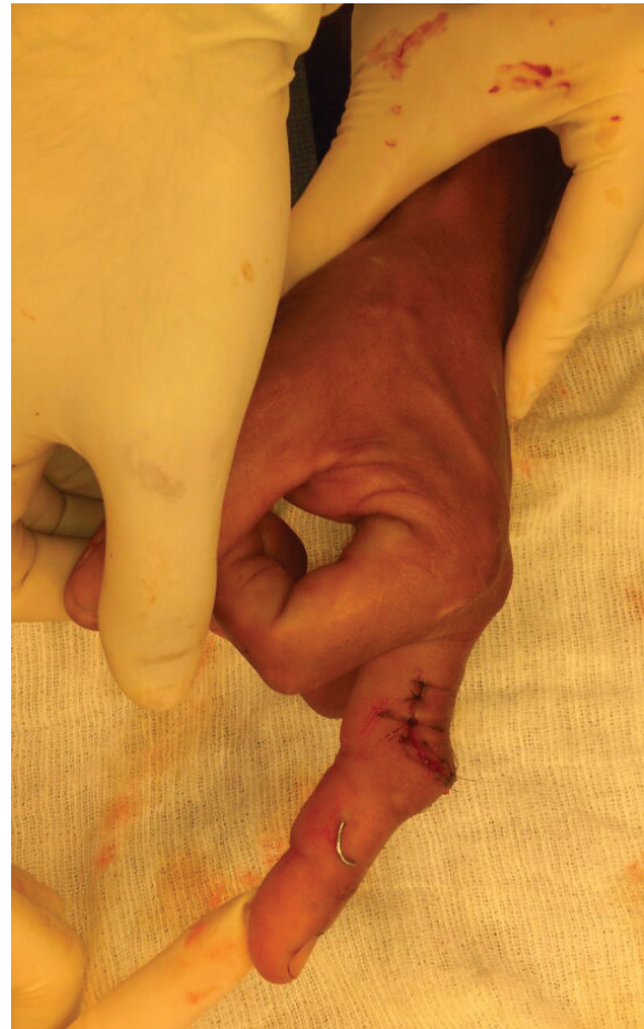
Fig. 10: Final appearance of finger after completion of Curtis procedure.