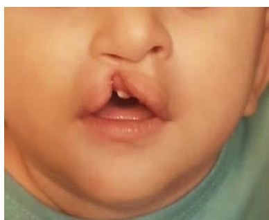
Figure 2: A. Before surgery

In the millard group, vermilion border was good and moderate in 50% and 28.6% of patients respectively, while, in the sommerlad group, vermilion border was good and moderate in 77.2% and 22.2% of patients respectively. In terms of vermilion border, no remarkable difference was observed between the