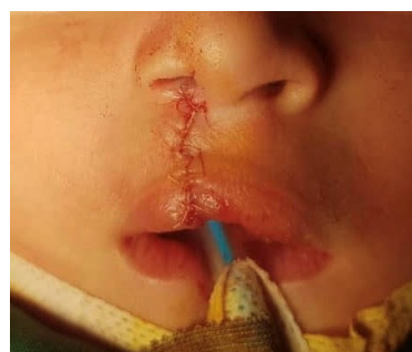
Figure 2: B. After surgery (Sommerlad)