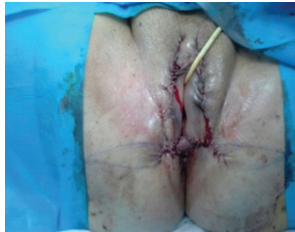
Fig. 3: Patient after surgery.