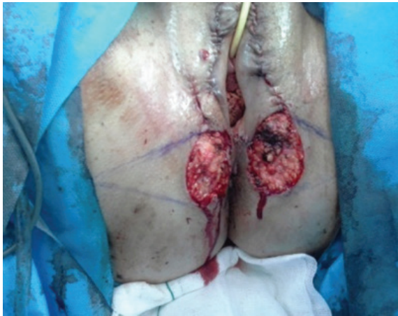
Fig. 2: Patient during the surgical procedure.