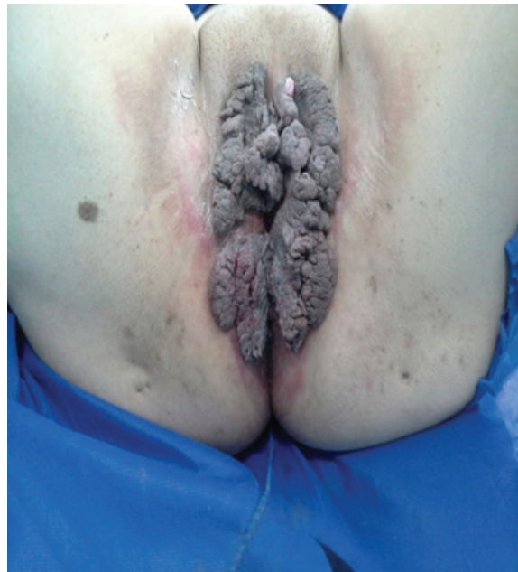
Fig. 1: Patient with giant condyloma prior to reconstructive surgery.

A 50-year-old female presented with cauliflower-like growth over the uvula region. The growth had been diagnosed previously as condyloma acuminatum which was resistant to conservative therapy (Figure 1). The patient was 35-year-old when she first noted the lesion and did not seek any medical help. Two years later she became pregnant and during pregnancy period, she received conservative treatment and lesion disappeared after her delivery. After 2 years during the first trimester of the patient's second pregnancy, warts appeared for the second time with altered clinical presentation; spread across the entire uvula region she underwent cryosurgery, but with no significant improvement