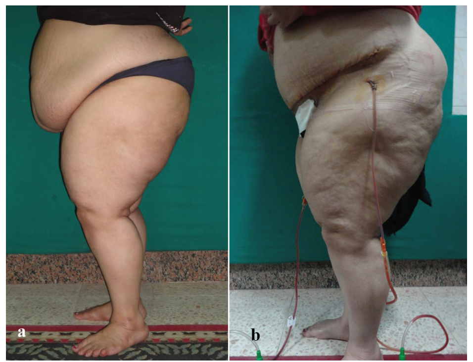
Fig. 5a, b: Preoperative and postoperative picture of abdominoplasty case with BMI >30 kg/m<sup>2</sup>.