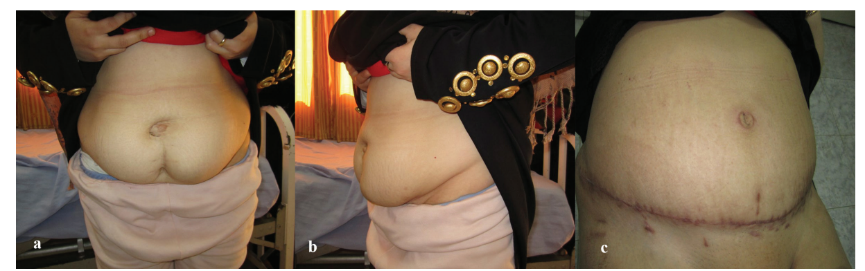
Fig. 2a, b, c: Preoperative and postoperative picture of abdominoplasty case with BMI <30 kg/m<sup>2</sup>.