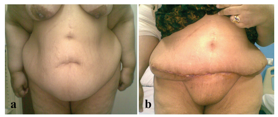
Fig. 6a, b: Preoperative and postoperative picture of abdominoplasty case with BMI >30 kg/m<sup>2</sup>.

sutures and two suction drains were exteriorized. The wound was closed (tension free) in two layers, vicryl 3-0 stitches were applied to fix the scarpa's fascia of the superior abdominal flap to the inferior scarpa fascia border.