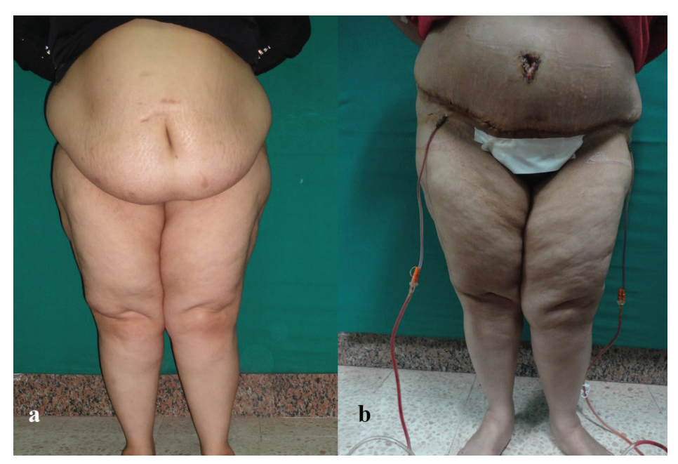
Fig. 4a, b: Preoperative and postoperative picture of abdominoplasty case with BMI >30 kg/m<sup>2</sup>.

Preoperative markings were crucial to successful surgery and to get desired symmetrical results. Patients were marked preoperatively in the standing position, and a transverse line was made just above the pubic hair extending laterally 7 to 18 cm in each direction towards the anterior superior iliac spine. Skin incision following the previously determined markings at the lower abdomen was done, sometimes a vertical incision from the umbilicus to the pubis was added to facilitate dissection. The umbilical scar was isolated (Figure 7) and dissection of the deep tissues was performed with electro cautery. Below