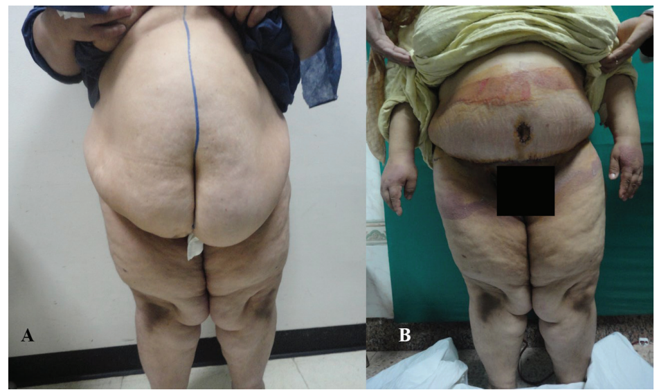
Fig. 3a, b: Preoperative and postoperative picture of abdominoplasty case with BMI >30 kg/m<sup>2</sup>.