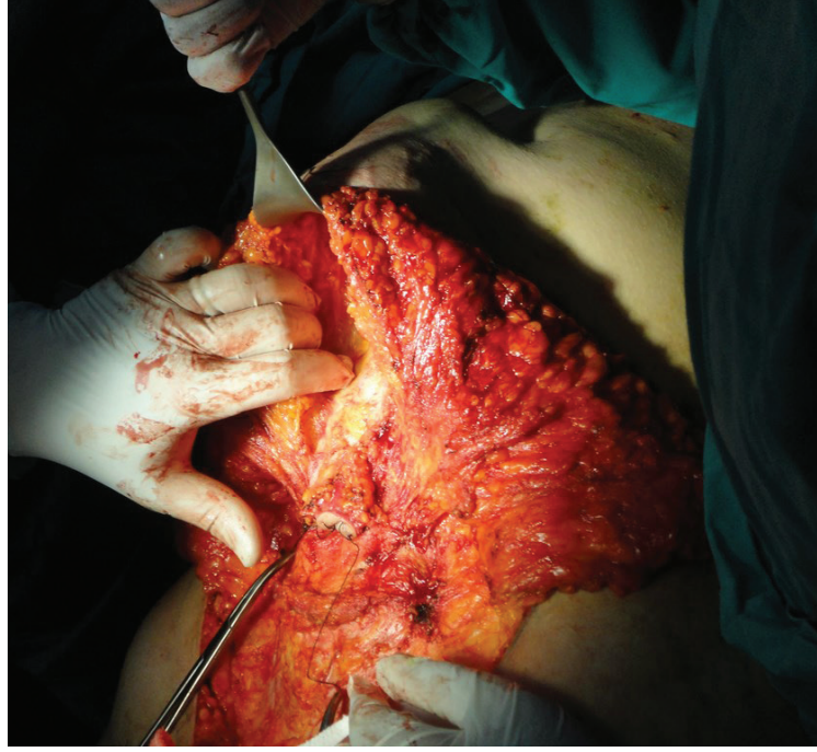
Fig. 7: Dissection of the umbilicus from the flap.