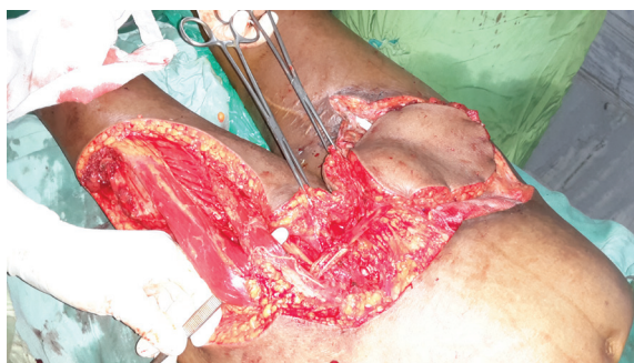
Fig. 3: Flap raising