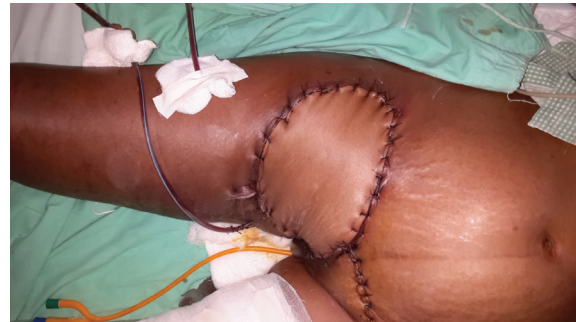
Fig. 5: Final appearance after flap inseting

lateralis (VL) was drawn from the anterior superior iliac spine to the lateral aspect of upper patella. A circle of 3 cm radius was drawn around the middle point of this line and perforators were mapped. The medial incision was placed first up to sub fascial level. The RF and VL were separated and the pedicle was identified and safeguarded. The vastus lateralis muscle was taken along with the flap preserving the musculocutaneous perforators and flap was fully mobilized up to the origin of the pedicle from profunda vessels.