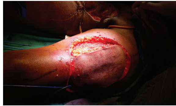
Fig. 4: Flap placement