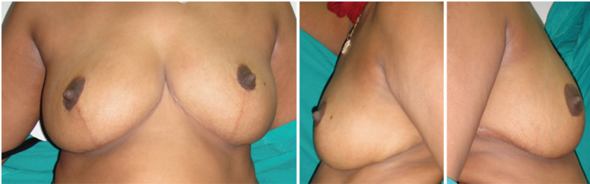
Fig. 1: Late post operative patient who had superomedial pedicle reduction mammoplasty showing good projection and contour of the breasts.