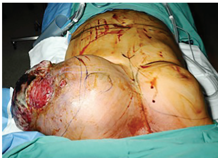
Fig. 3: The incision extending laterally to involve the skin of the upper outer quadrant excised en block with the breast and replaced by the island of skin from the latissimus musculocutaneous flap. At one point the lesion was seen invading into skeletal muscle. All excision margins were clear.

In a large study of 165 patients from the Institut Curie in Paris the surgical management of 3 cm median in size tumors was examined. The majority (97%) of patients received simple not wide local excision with only 3% having received oncological wide local excision or mastectomy operations. The 28% of cases had infiltrated margins and the reoperation rate reached 52%. 8 Most authors consider excision margin to be positive if the tumor was present at or close to (<1 mm) the inked tissue on histopathology. 5 In fact, taking into account that local recurrence of phyllodes is high and that an affected margin is the single independent predictor of local recurrence is therefore understandable the paramount significance of the wide excision in the local recurrence-free rate. 5,9