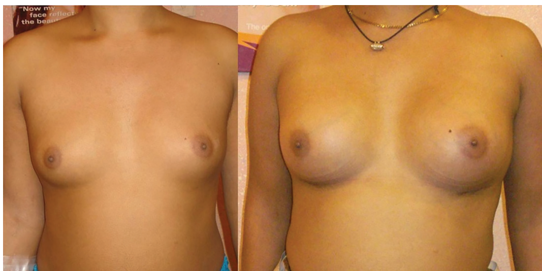
Fig. 3: Infra-mammary augmentation.