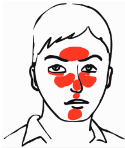
Fig. 2: The central facial distribution of rosacea.

extreme hot or cold weather. 2 Vascular rosacea is the second stage and is considered the first definitive stage of rosacea, which consists of persistent erythema, edema, telangiectasia and ocular rosacea. The third stage is inflammatory rosacea and consists of papules and pustules. The final stage is rhinophyma. 5 It is important to note that rosacea can present at any stage and may not progress to later stages (Figure 2). 6