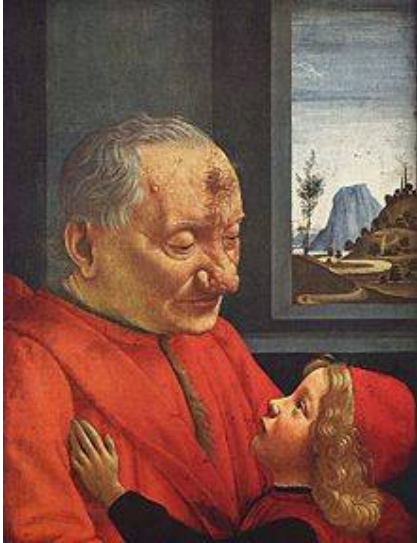
Fig. 1: Domenico Ghirlandaio depicts a patrician with a large rhinophyma.

Although rhinophyma is a benign disorder, the physiological, cosmetic and psychological aspects of the disease are great in number. Large rhinophymas can cause distortion and obstruction of the nasal cavity making breathing difficult. Possibly resulting in obstructive sleep apnea, which can lead to many other health problems. 3 There have also been accounts of rhinophymas containing occult cancers, such as squamous cell and basal cell carcinomas. 4 The disorder causes progressive disfigurement which can be anxiety-provoking and disturbing to the patient. Patients may become embarrassed or depressed about their appearance, sometimes resorting to reclusive behavior. 2 Historically, rhinophymas have been a source of negative stigmatism. Having a rhinophyma was considered a sign of alcoholism, as implied by the term “whiskey nose” or “rum nose.” 3 While it is true that alcohol can cause the skin to have a flushed appearance, rhinophymas are not found solely in alcoholics. 8