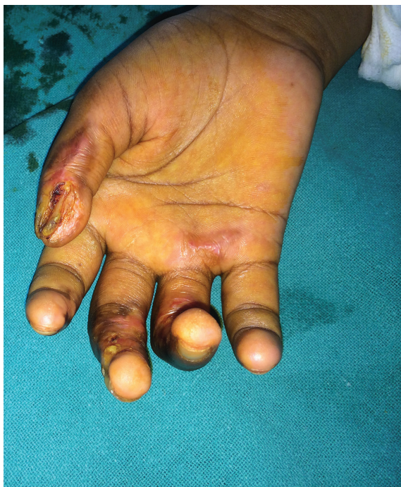
Fig. 3: Photograph shows healing second degree superficial burn of right hand in case 4.

to create calcium sulfate and then grinding it into a fine white powder. When water is added to the powder it quickly rehydrates and the slurry