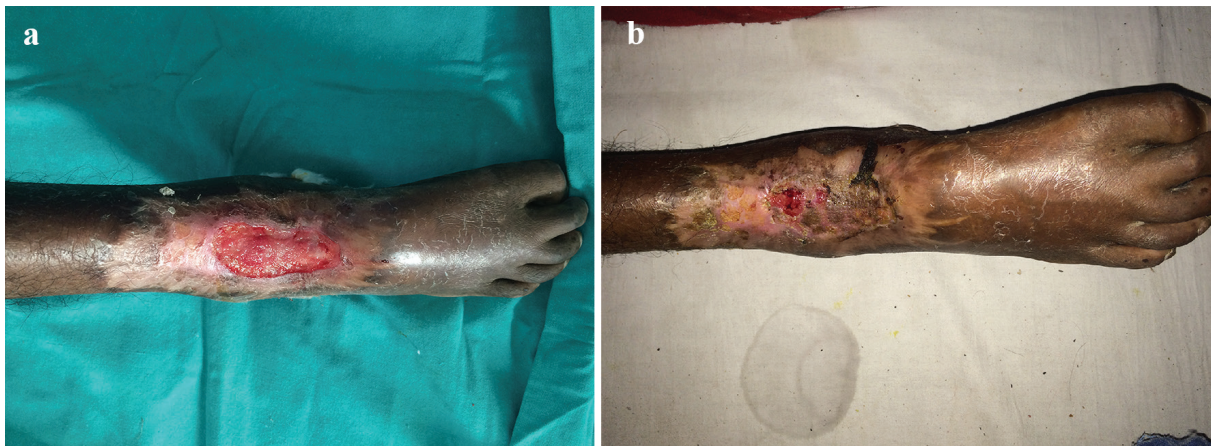
Fig. 4: a: Preoperative photograph shows 2nd degree plaster burn right foot dorsum in case 6. b: Post STSG photograph of right foot dorsum shows partial loss of skin graft in case 6.

As temperature of the thermal insult increases, the time required to produce a specific injury is decreases substantially. 4