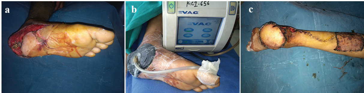
Fig. 2: a: Preoperative photograph shows 4th degree plaster burn left heel in case 5. b: Preoperative photograph of 4th degree plaster burn left heel with VAC in case 5. c: Postoperative photograph after reconstruction with reverse sural flap in case 5.