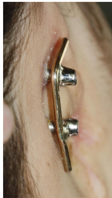
Fig. 5: Bar retention clip system.

By using dental wax or modeling clay or both of them, the prosthetic ear was sculpted on the model. To make sure of the right dimension of the sculpted ear and its compatibility with patient facial features, the sculpted ear was tried on the patient. The mold was packed with silicone rubber, which is the material of choice for most maxillofacial prosthesis at the moment. After polymerization of the silicone, the prosthesis was finished with abrasive wheels. Extrinsic coloring was added to the prosthesis with the patient present so that the color, hue and tone of the patient's skin could be matched perfectly. The prosthesis was then placed on the patient (Figure 6). The prosthesis could be used constantly and there was no need for rinsing.