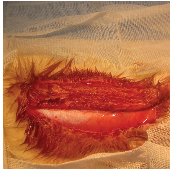
Fig. 1: Caudally based random skin flap in 2x9 cm.

surface of the flaps. Ten days after surgery, the animals were examined by the third examiner and the amount of necrotic segment of the flap was measured with metric ruler in contrast to healthy segment (Figure 2). The results were presented as percentages of skin necrosis area (mean±standard deviation). The difference in the mean percentage of flap necrosis between the two groups was analyzed with statistical package for social sciences (SPSS) software (version 16, Chicago, IL, USA). A p value less than 0.05 was considered statistically significant.