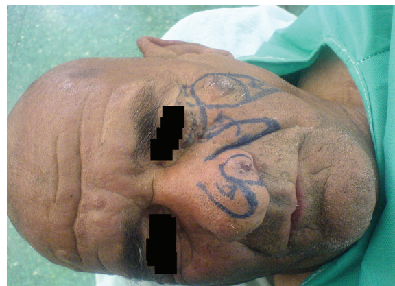
Fig. 1: A 72 years old patient with BCC in lower lid.

The eight patients were 6 males and 2 females, aged between 40- 72 years. Two week post-operation, the pledge was removed. Details of patients including age, sex, defect size, complications and follow up periods were mentioned in Table 1. As displayed in the table, at 6 months follow up of 8 patients, there was not any ectropion. Inflammation was observed only in 1 case (Figure 1-5).