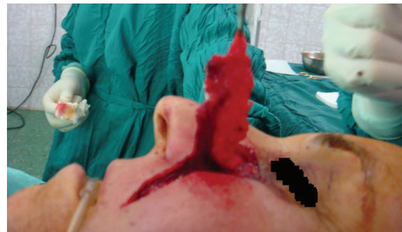
Fig. 5: Dermal pennant in the distal end of flap.