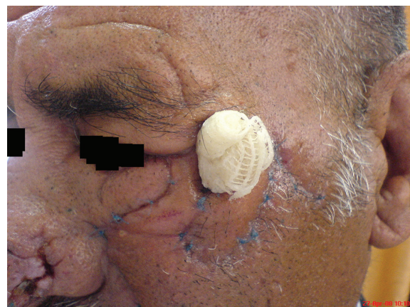
Fig. 2: Dermal pennant fixed in place.