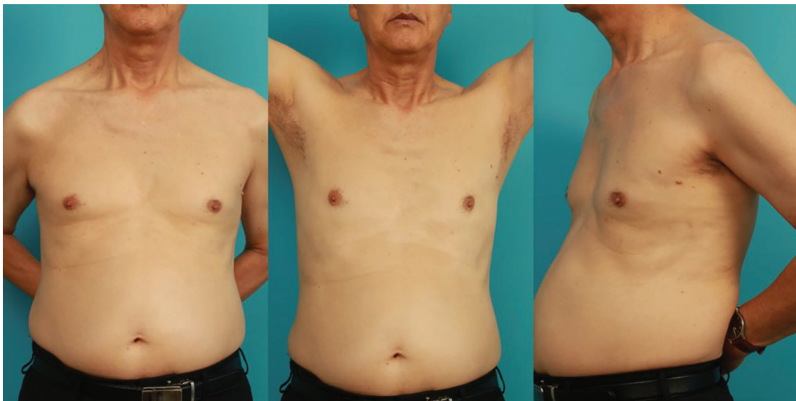
Fig. 2: (A) 72 year-old male who underwent subpectoral ICD insertion two months ago. (B, C) The short axillary incision scar is visible only when the patient's arms are held up, and even then only barely.

Of the 266 patients who underwent CIED implantation at Seoul St. Mary's Hospital, the subpectoral implantation was performed in 32 (12%) patients, whereas 234 (88%) patients underwent conventional prepectoral implantation. Of the 32 patients who underwent subpectoral approach, new implantations of CIED were in 24 of 32 patients (Figure 2) and 8