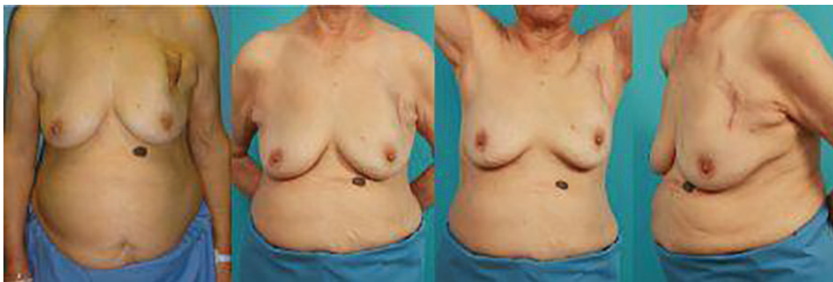
Fig. 5: A 79 year-old female patient who underwent conventional prepectoral implantation. (A) The skin overlying the device had become very thin and showed infection signs. (B, C, D) After pocket change to the subpectoral pocket and excision of necrotic skin, the patient no longer could palpate the device, and risk of device protrusion was minimized.

prepectoral pockets that medically require or electively choose to receive this procedure. The use of CIED has sharply increased because recent technical advances have enhanced functional aspects and expanded treatment indications. 7-9 The conventional prepectoral implantation technique has been widely used because it is easily and quickly performed without the need of surgical collaboration requiring less demanding surgical skills. 10