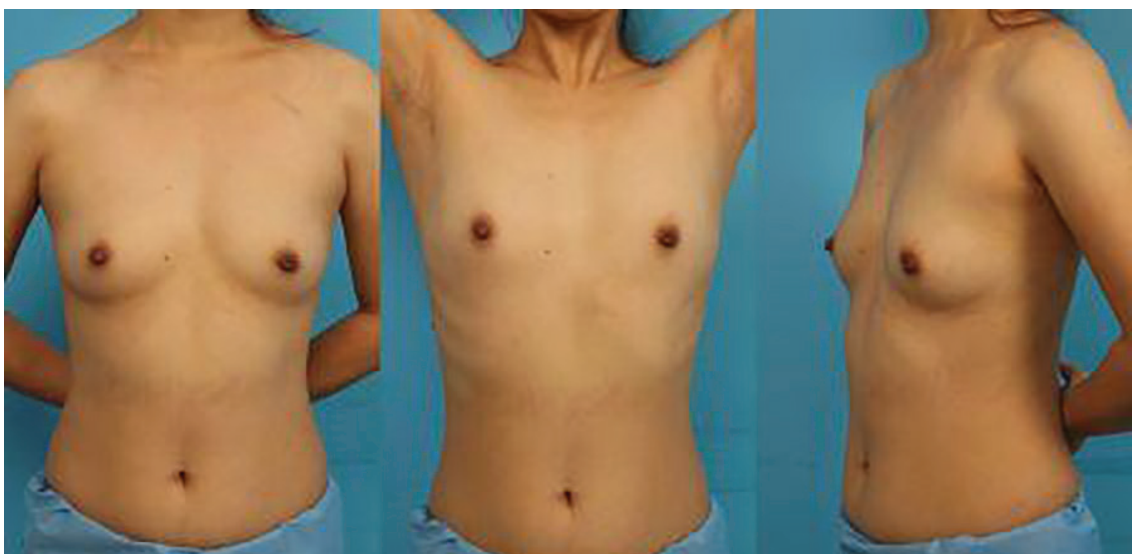
Fig. 3: A 35 year-old female patient who underwent a subpectoral implantation 11 months ago with an additional subclavian venous approach. (A) The subclavian scar is visible upon anterior view. There is no asymmetry of the breasts. (B, C) The axillary incision is barely discernible even when the patient lifts her arms up.