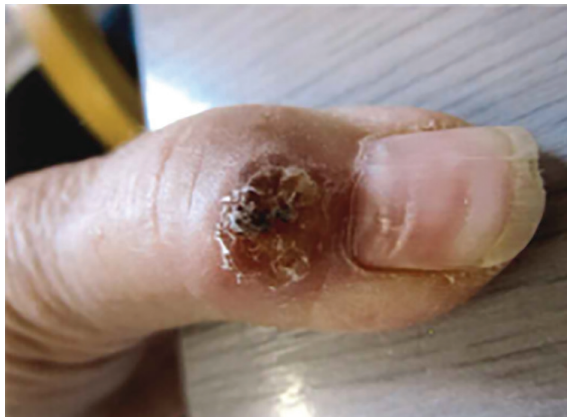
Fig. 1: Appearance of lesion at presentation to the clinic.