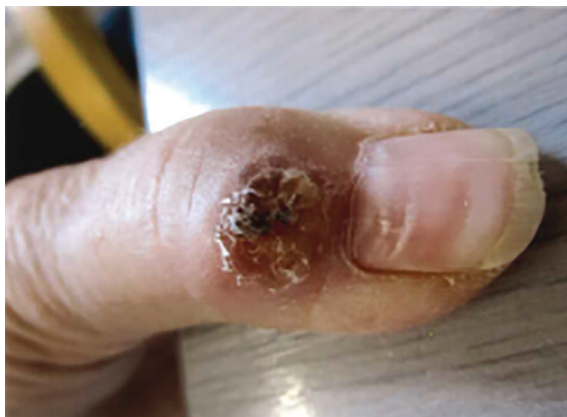
Fig. 1: Appearance of lesion at presentation to the clinic.

be easily dissected from the surrounding tissue. The histopathology evaluation was suggestive of a cystic lesion lined by squamous epithelium and suggestive of an inflamed pilar cyst. There was no recurrence at her 3 month follow up and the operative site had healed well.