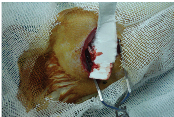
Fig. 1: The nerve repair with fibrin glue and without suture.

Ten male rats weighing approximately 250-300 g were enrolled. The experimental protocol was approved by ethical committee of our University. All surgical procedures were done under systemic anesthesia (ketamine, 5 mg/kg). During the surgery, sciatic nerve was exposed by incision on left thigh and splitting of the gluteal muscles. The nerves were sharply transected and repaired by suturing with nylon 9-0 under loupe magnification in group A and by fibrin glue in group B (bovine fibrin glue, Tissucol; Figure 1).