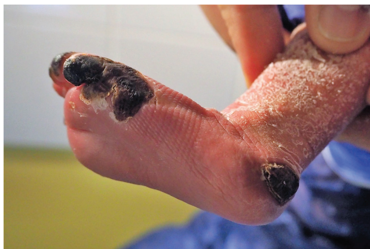
Fig. 1: Left foot of a newborn child after second degree burn of the big toe, tip of the third, fourth and fifth toe, lateral foot margin and the heel on the sixth day of treatment with Adaptic®.

On the 34 th day of life, the last crust was removed from the small toe and the big toe. Below, rosy, well-perfused skin showed a capillary refill time of less than 2 seconds. The