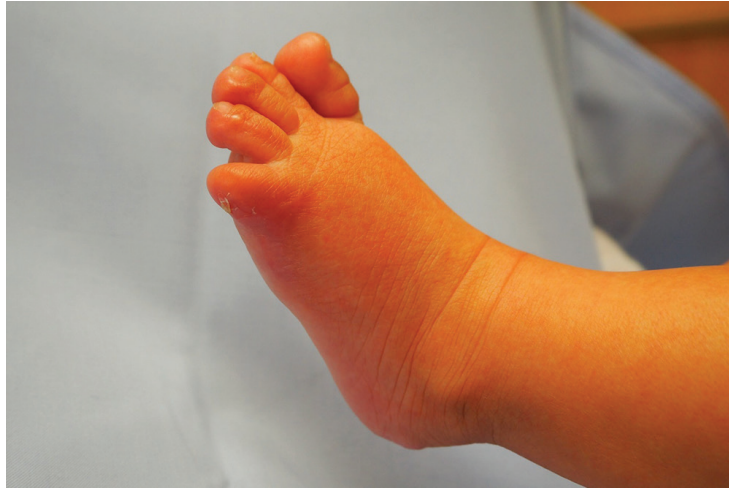
Fig. 2: Lateral foot margin three months after burn. Lateralization of the toenail and complete re-epithelialization.