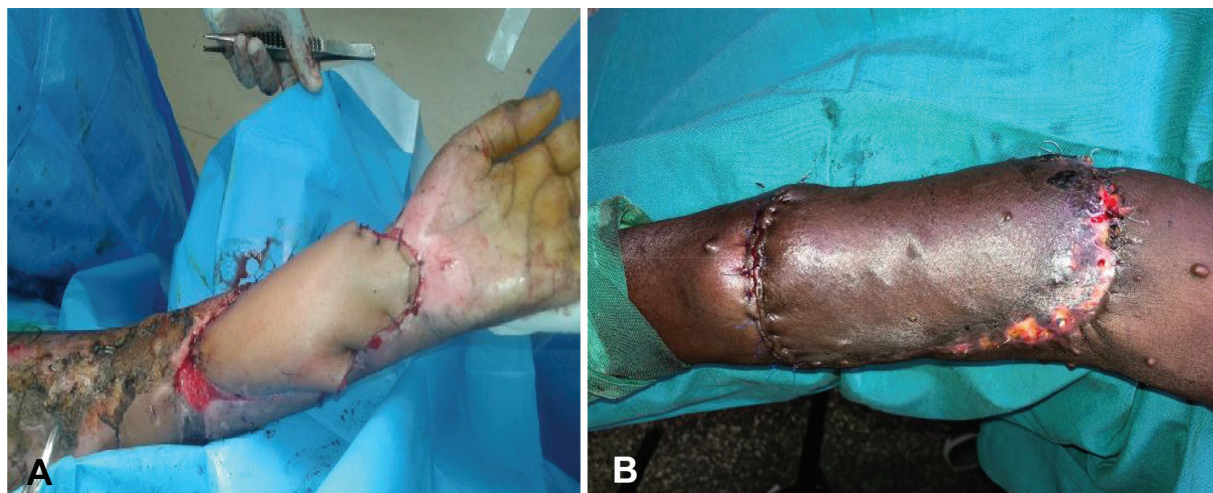
Fig. 5: A. Left volar arm defect fully covered with the two vessel paraumbilical flap immediately after separation. B. Left arm wound fully covered with the paraumbilical flap at 2 months of follow up. Note that the defects had extended between the wrist and the elbow.

advanced into the defect and secured with sutures (Figure 4). After 21 days, the flap was detached and the donor wound closed primarily (Figure 5). The variables measured were the size of the flap, flap-related complications and donor site morbidity.