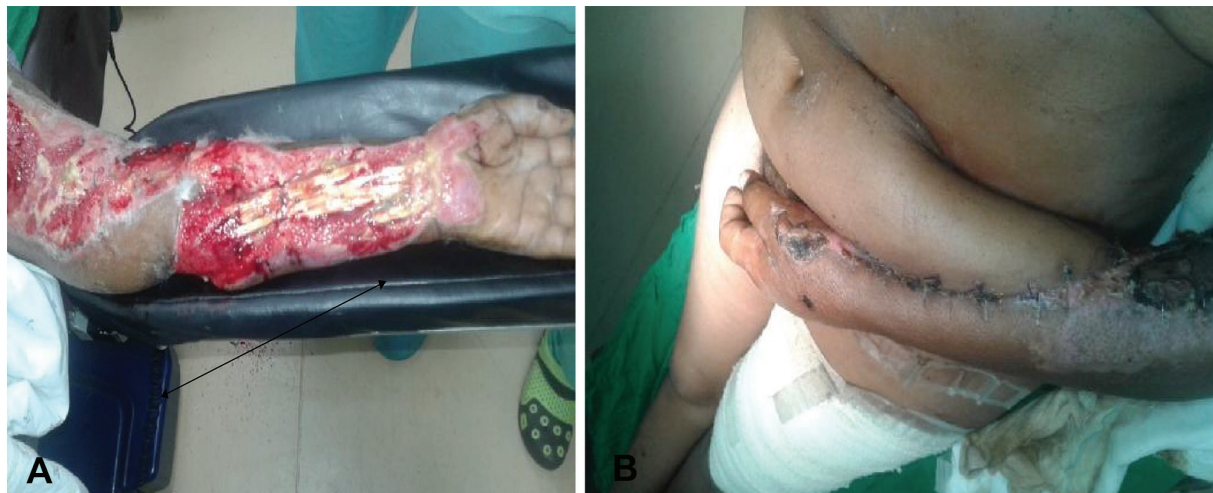
Fig. 4: A. Patients with exposed tendons and neurovascular structures ready to be covered with paraumbilical flap of dimensions 24×10 cm. B. Perforator paraumbilical flap successfully anchored to the recipient site.