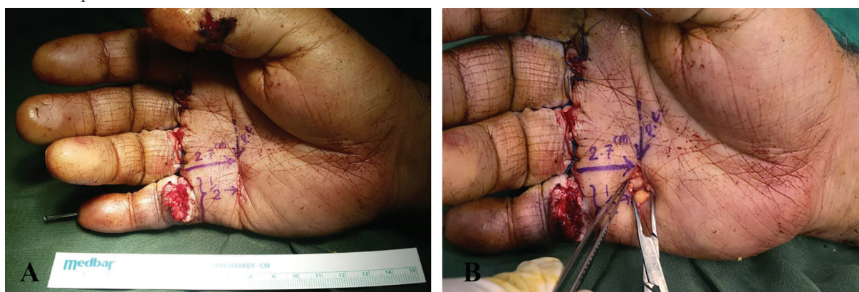
Fig. 3: A: A 37-year-old man has multiple injuries in Zone 2 due to cuts while working with a saw machine. B: After exploration of his deep flexor tendon.