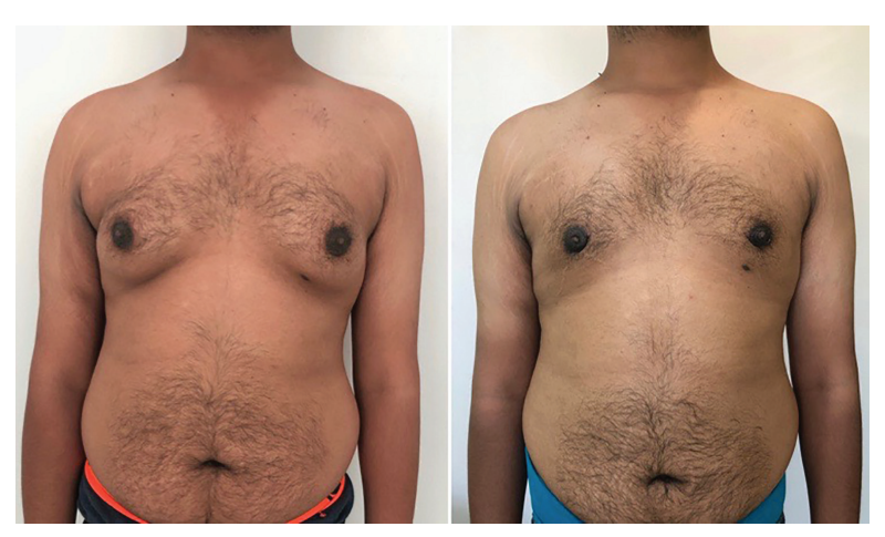
Fig. 4: Pre and post-surgery (2 months) photos, bilateral grade IIAL.

of a firm to hard mass under their nipples during the puberty. Most notice it under their school uniforms. Many of them are subjected to jokes or ridicule and some even suffer various psychosocial issues. Many students start wearing loose fitting shirts during these periods hoping the gynecomastia gets noticed less. Many others try working out. We have noticed many students