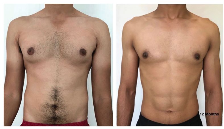
Fig. 2: Pre and post-surgery (12 months) photos, grade 1T.