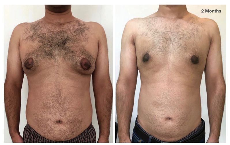
Fig. 3: Pre and post-surgery (2 months) photos, grade IIAT on the right side and IIBT on the left.