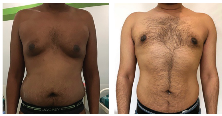
Fig. 5: Pre and post-surgery (8 months) photos, bilateral grade IIBL.

is credited to Paulas Aegineta (625–690 AD), a Byzantine Greek physician.<sup>8</sup> Webster in 1946 described semicircular intra-areolar incision. Current surgical techniques favor standard liposuction/suction-assisted liposuction (UAL) and ultrasound-assisted liposuction (UAL) with a combination of removal of breast tissue, with the advantage of tackling both the fat and the breast tissue. Surgery should be considered in patients with cosmetic concern, discomfort, psychological stress and longstanding gynecomastia (>12 m).<sup>9</sup>