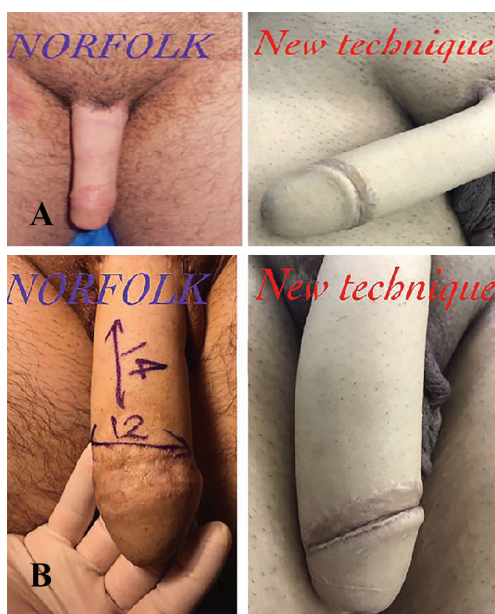
Fig. 4: A: Results at 6 months post operation. B: Results at 12 months post operation.

up; however, only 70% of patients in Norfolk group reported acceptable results, which was significantly lower than new technique group (Figure 4A). Similarly, at 12-month follow-up, 80 and 40% of the patients, respectively in new technique and Norfolk groups reported acceptable results, which was also significantly higher ( p < 0.001 ) in new technique group (Figure 4B). Likewise, at 12-month postoperative follow-up, the assessors considered 90% of the results as acceptable in new technique group, which was remarkably significant compared to 55% of acceptable results in Norfolk group.