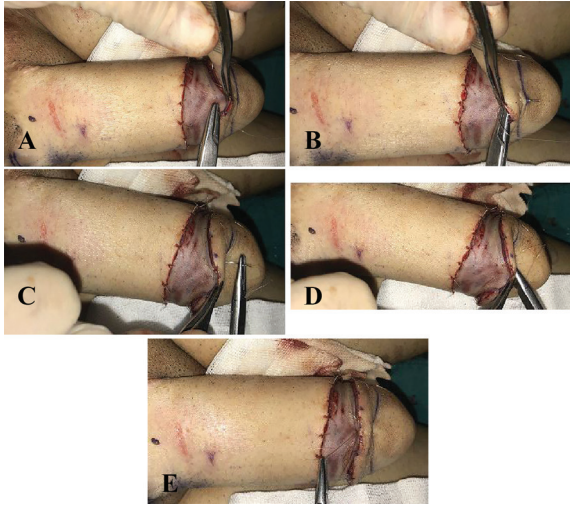
Fig. 2: A: First needle passage. B: Full thickness suture. C: Making horizontal mattress suture. D: Second needle movement. E: Knotting.

an 11- cm long incision was made about 3 cm dorsally away from the tip, and was deepened to the subcutaneous tissue (1). Distal undermining from the incision site was carried out for about 1 cm on the dorsal aspect reducing to 0.5 cm on the ventral aspect (Figure 3B). The circumferential skin flap created from undermining was folded over itself and was fixed with mattress sutures (Figure 3C).