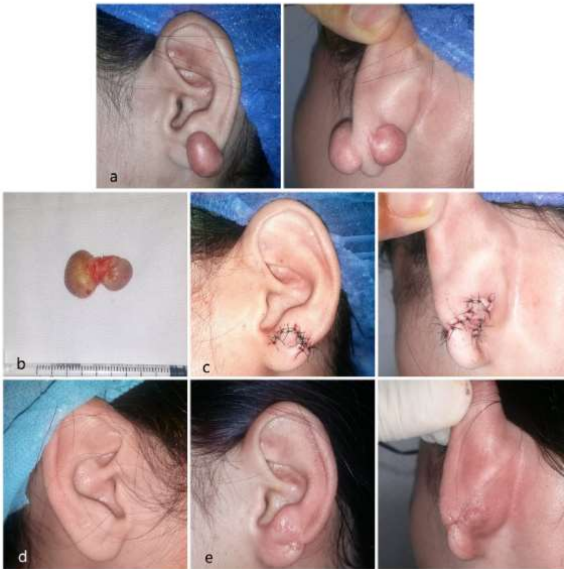
Fig. 2: 2a. Preoperative views. 2b. Completely resected dumbbell-shaped keloid. 2c. Immediate postoperative views, showing earlobe reconstruction. 2d. Contralateral earlobe for aesthetical comparison. 2e. Postoperative views 1 month later.

Stahl et al. reported a recurrence rate of 26% with keloid resection and a perioperative “sandwich” radiotherapy protocol, that consisted in delivering a total dose of 10 to 12.5 Gy in two fractions including a day before and a day after the operation. 13 A recent report from Ogawa et al. , comparing different radiotherapy protocols after surgical excision, showed that 15 Gy administered in three fractions over three days resulted in a 5.7% recurrence rate, 10 Gy in two fractions over two days resulted in 4.6 to 6.9% recurrence rate, and 8 Gy administered in one fraction was associated with a total recurrence rate of 9.3% with no adverse effects. 9