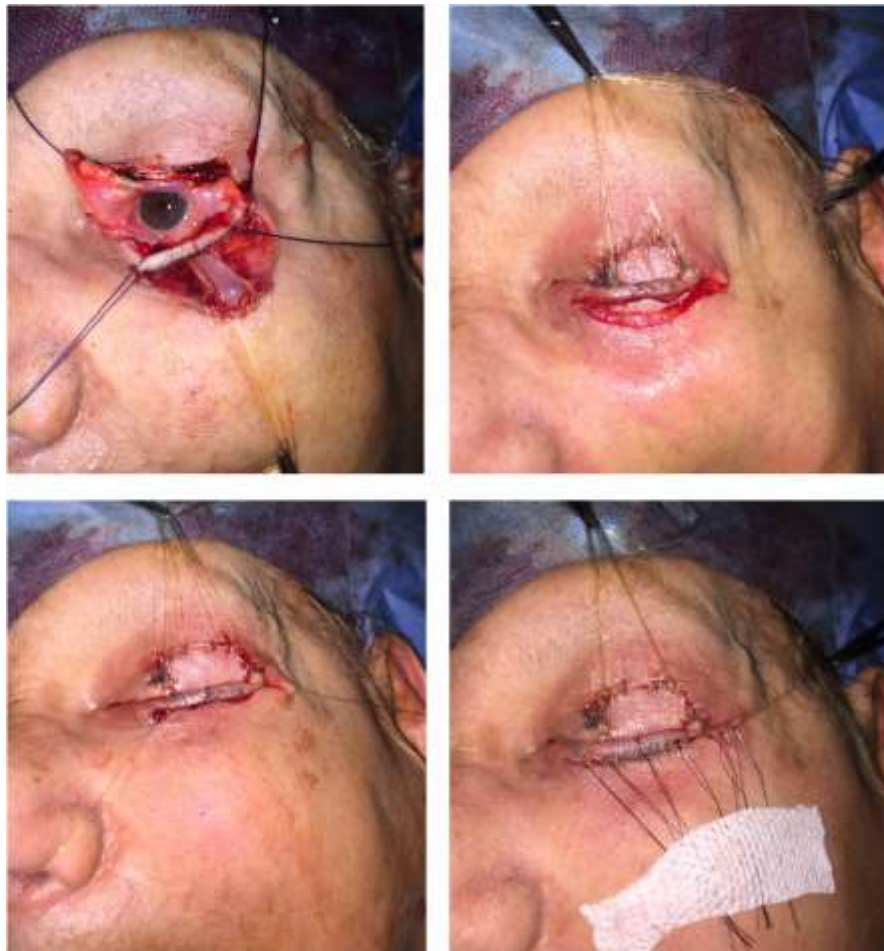
Fig. 2: Intra-operative view.

After expected defect was identified, lower eyelid orbicularis oculi muscle was detected, asking the patient to close his eyes tightly. A lower eyelid cutaneous island lying just above orbicularis oculi muscle was planned and shaped on upper eyelid defect, following radical resection of the tumor. Surgery was performed under local anesthesia with lidocaine with adrenaline 1:100,000. After excision was performed, maximum length of defect was measured and skin incision at the periphery of lower eyelid flap, dissection was carried out in a submuscular plane, below attachments of capsulopalpebral fascia to lower lid tarsus (Figure 2). The de-epithelised pedicle was buried deep beneath lower lid tarsus and flap was sutured tarsus to tarsus into defect using absorbable sutures. Flap pedicle division was undertaken under local anesthesia 4 wk after procedure 1,2 .