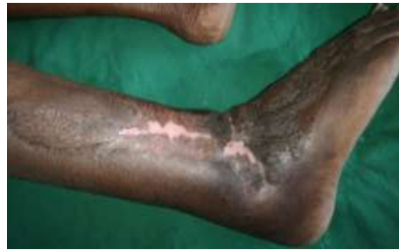
Fig. 4d: Four months post-operative, excellent foot contour.