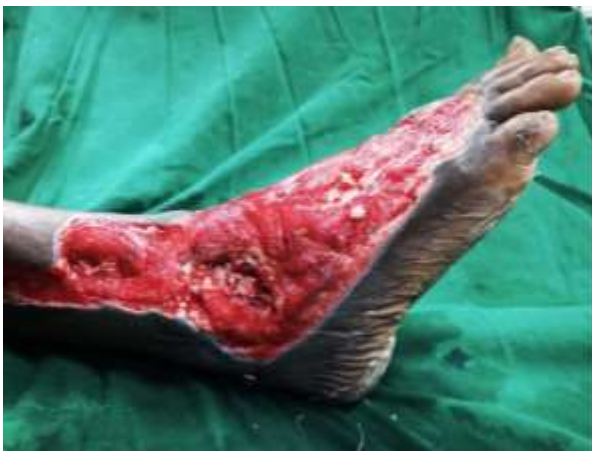
Fig. 4a: Right foot ulcer with exposed ankle joint

anastomosis to the anterior tibial artery and a skin graft applied (Figure 4b and 4c). Post operatively at 4 months follow-up showed a well-settled flap with excellent foot contour and graft take (Figure 4d).