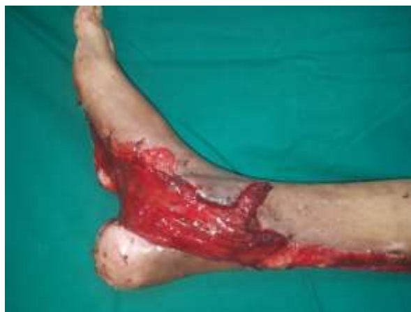
Fig. 5b: After gracilis flap cover