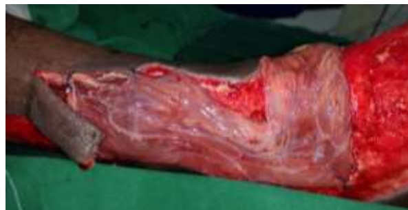
Fig. 4b: After gracilis flap cover