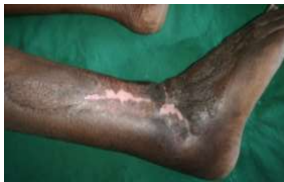
Fig. 4d: Four months post-operative, excellent foot contour.