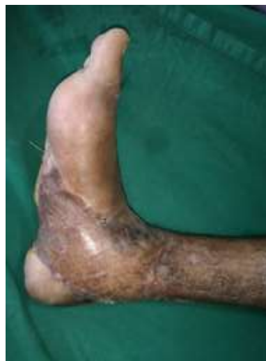
Fig. 5d: 6 months post operative, excellent foot contour