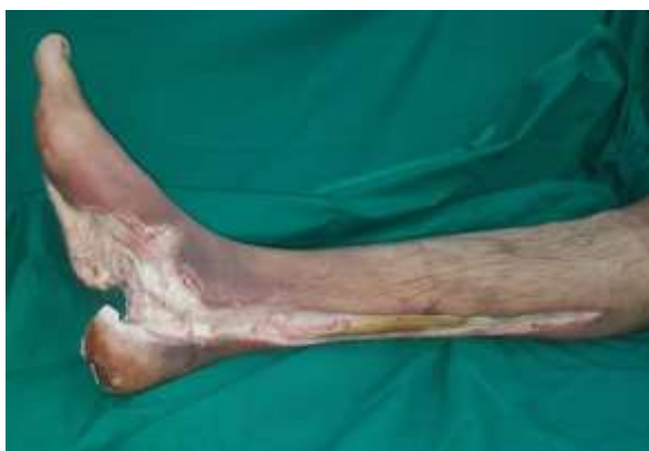
Fig. 5a: Right foot infected ulcer

and 5c) with end to side anastomosis to the posterior tibial artery, the patient had a good graft take and excellent foot contour (Figure 5d).