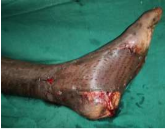
Fig. 3c: Flap covered with split-thickness skin graft