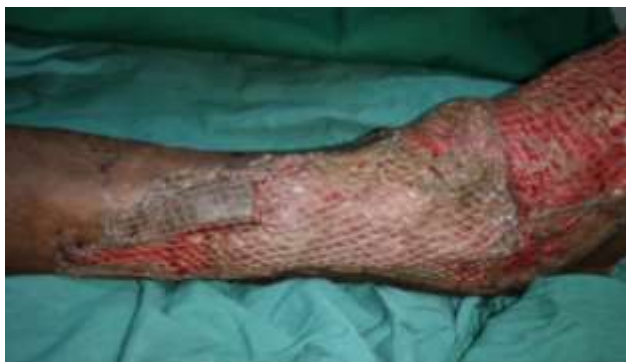
Fig. 4c: After split thickness skin graft