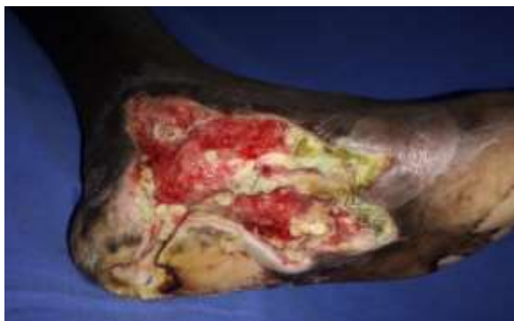
Fig. 3a: Left foot diabetic ulcer