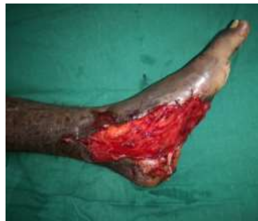
Fig. 3b: Free Gracilis muscle flap attached to ulcer