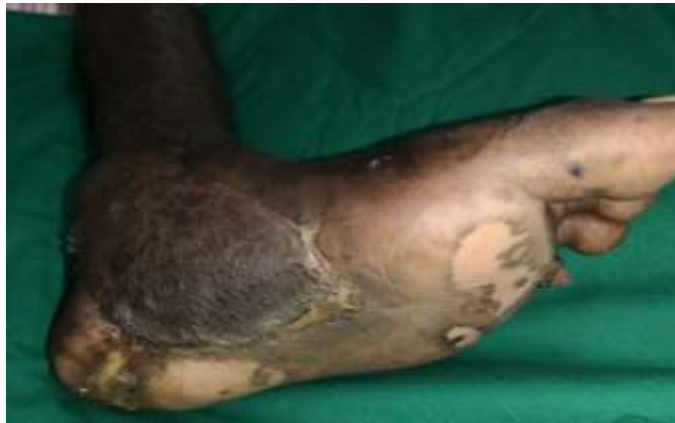
Fig. 3e: After 4 months follow up well-settled flap