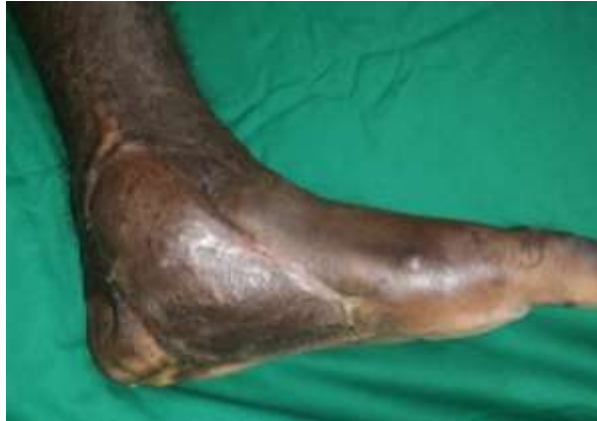
Fig. 3d: After 4 months follow up well-settled flap