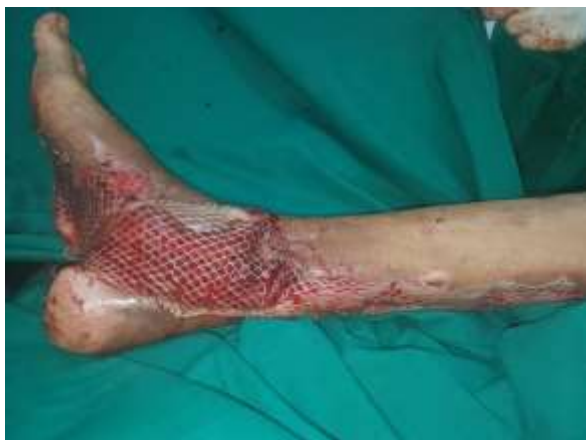
Fig. 5c: Flap covered with skin graft