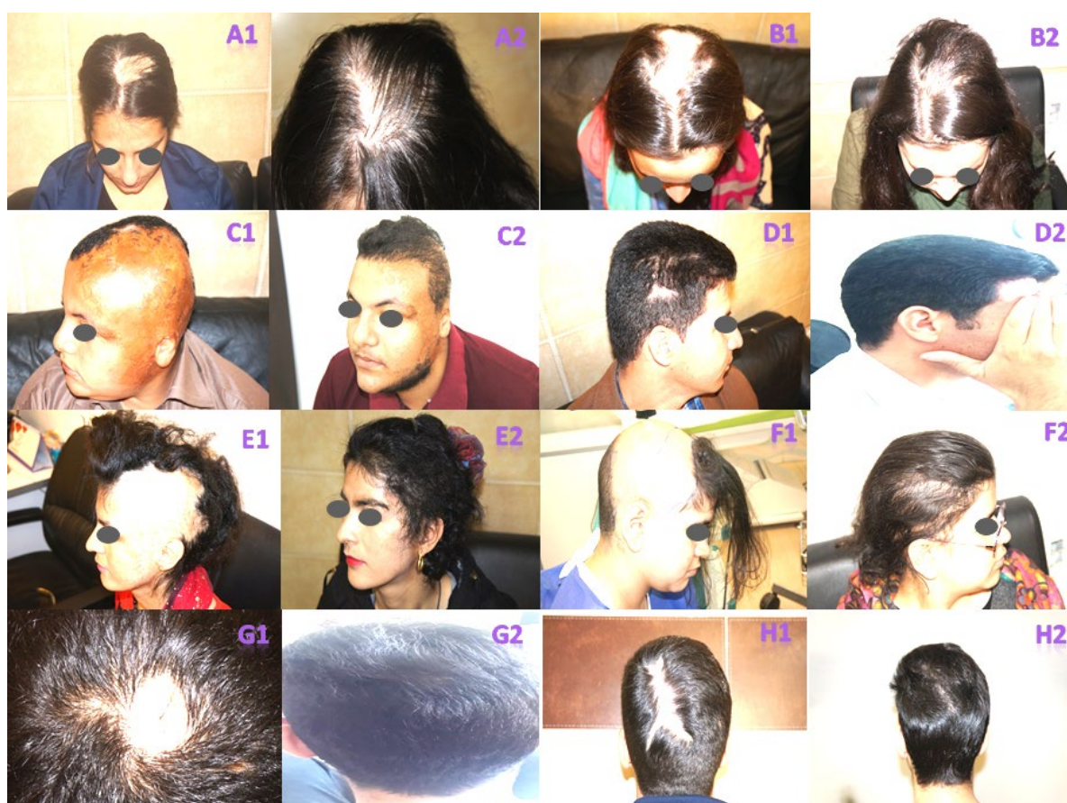
Fig. 1: Causes and number of hair grafts in scarring lesions of the scalp before and after transplantation. A: FUE of 1320 two-hair, and 700 three-hair grafts post-traumatic scarring alopecia. B: FUE of 700 two-hair, and 400 three-hair grafts in Kerion scarring alopecia. C: FUE of 360 one-hair, 950 two-hair, and 1015 three-hair grafts in burn scarring alopecia. D: FUE of 135 two-hair, and 135 three-hair grafts post-traumatic scarring alopecia. E: FUE of 200 one-hair, 1800 two-hair, and 1000 three-hair grafts in burn scarring alopecia. F: FUE and FUT of 1460 two-hair, and 1900 three-hair grafts post-radiotherapy scarring alopecia. G: FUE of 300 three-hair grafts in Morphea scarring alopecia. H: FUE of 270 two-hair, and 730 three-hair grafts in Kerion scarring alopecia.

which can make elliptical donor harvesting the other choice when needed 1 .