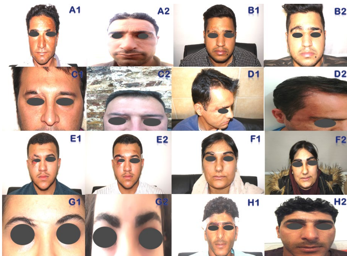
Fig. 2: Causes and number of hair grafts in scarring lesions of the beard and moustache before and after transplantation. A: FUE of 1850 one-hair grafts in burn scarring alopecia. B: FUE of 420 one-hair grafts in leishmaniasis scarring alopecia. C: FUE of 1150 one-hair, and 900 two-hair grafts in burn scarring alopecia. D: FUE of 1150 one-hair, and 900 two-hair grafts in burn scarring alopecia. E: FUE of 400 one-hair, and 750 two-hair grafts in burn scarring alopecia. F: FUE of 1150 one-hair, and 900 two-hair grafts post-traumatic scarring alopecia. G: FUE of 150 one-hair grafts using beard source in burn scarring alopecia. H: FUE of 120 one-hair grafts using beard source post-traumatic scarring alopecia.

while age was not a determining factor too 1 . Women have been a minority among patients undergoing hair transplantation for scarring alopecia too 20 ; and in our study, male and female subjects consisted 71.4% and 28.6% of the patients, respectively denoting to the minority of women undergoing hair transplantation.