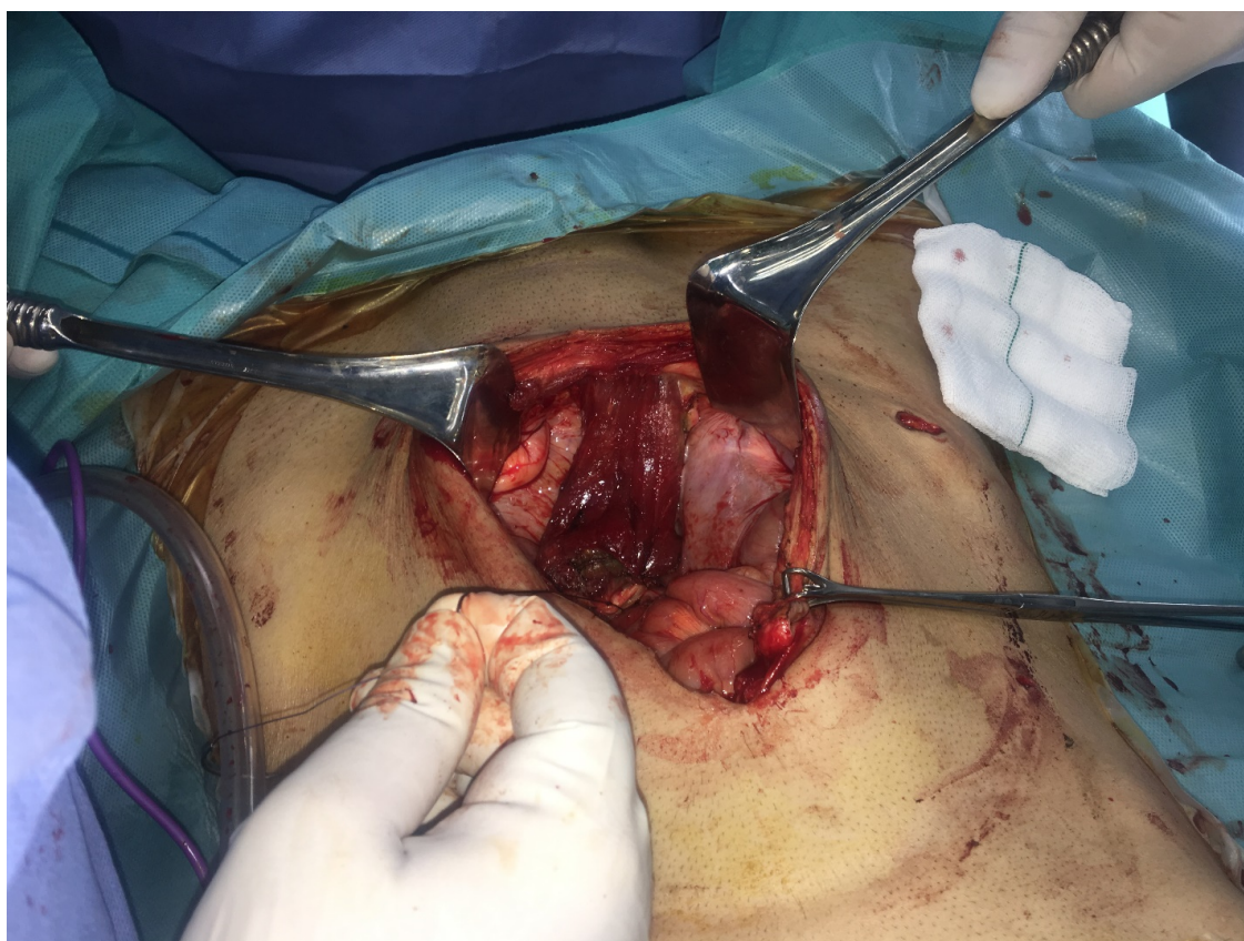
Fig. 5: Multiple layered sutures were used to place the flap without tension