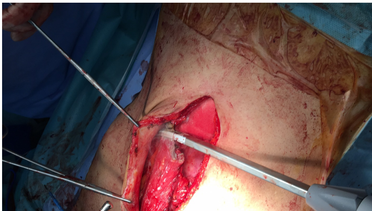
Fig. 2: The inferior part of rectus abdominis muscle was cut just below the arcuate line and medial to the semi lunar line

midline incision was closed using anterior rectus fascia of both sides and posterior fascia of the left side. Skin closed using 3-0 separate nylon stitches.