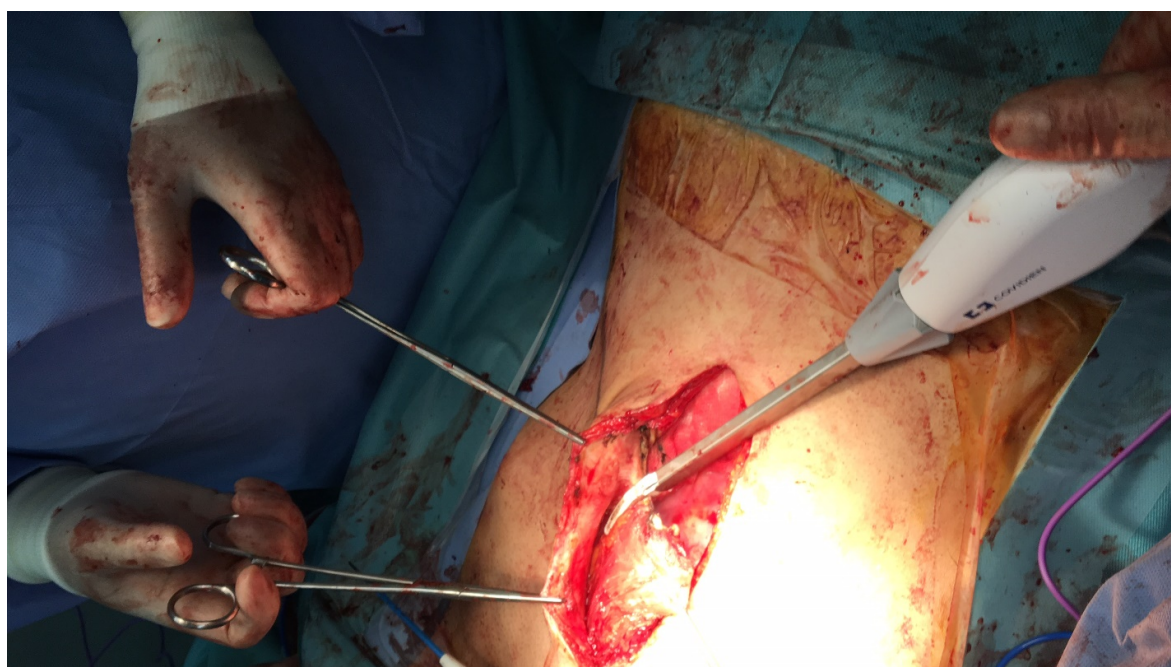
Fig. 3: The inferior part of rectus abdominis muscle flap dissection was continued to the origin which is on the pubis