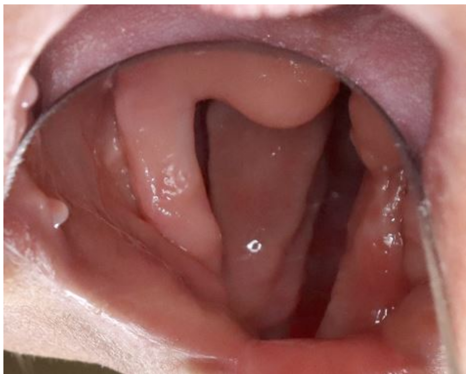
Fig. 1: Wide palatal cleft in patient with RHS. Note: large inferior turbinate was obvious.

The authors certify that they have obtained all appropriate patient consent forms. The patient has given her consent for her images and other clinical information to be reported in the journal. The patient understands that her name and initial will not be published and due efforts will be made to conceal her identity, but anonymity cannot be guaranteed.