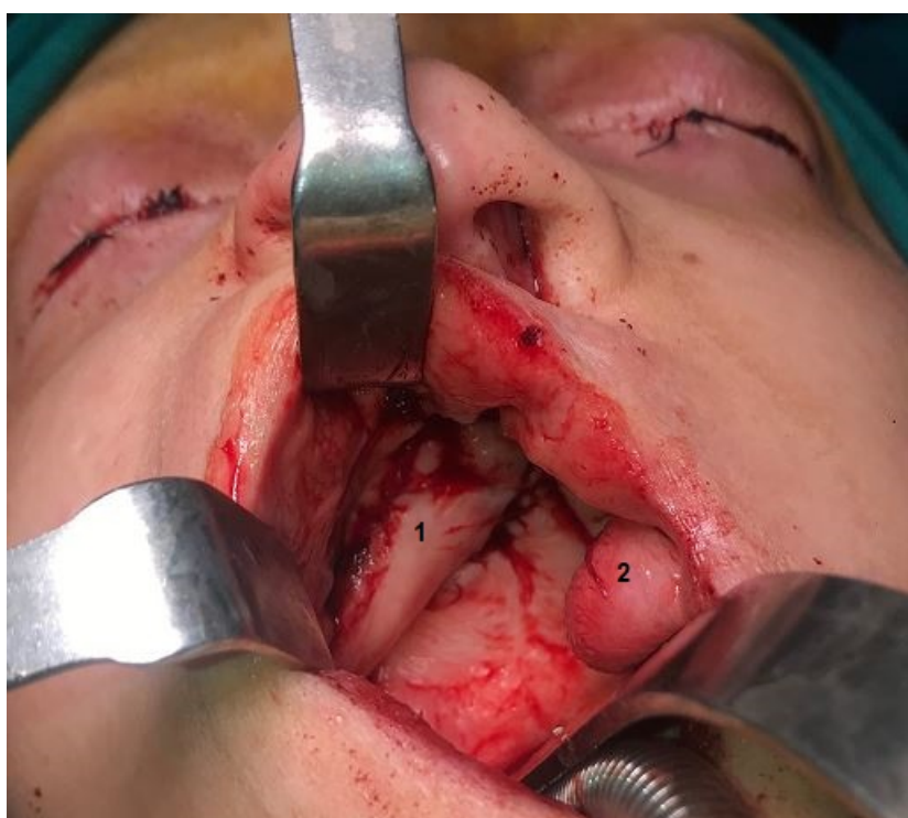
Fig. 3: Repair of palatal cleft with FAMM (1) +ITF. Number (2) shows the tongue.