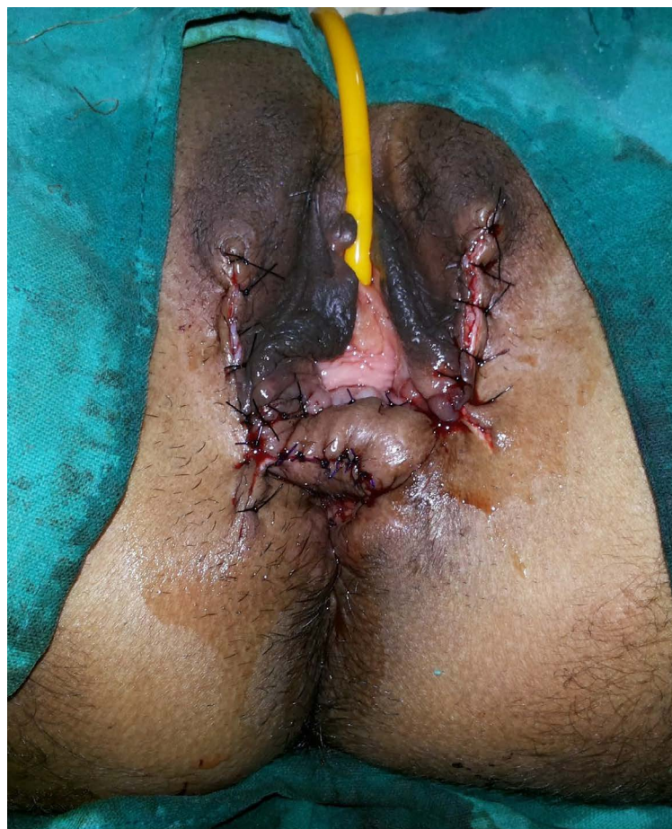
Fig. 3: Flaps transposed at defect in side-to-side manner