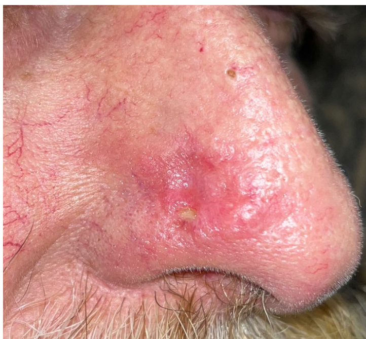
Figure 3: Patient at postoperative week 8. As is shown in the figure, there was excellent healing and no signs of graft rejection.

plain were used every 3 mm to suture the graft to the surrounding skin. A “sandwich” silicone splint was secured in the nasal sidewall with a 5-0 nylon full-thickness suture. The skin containing part of the composite graft was left uncovered for monitoring. Finally, the PRP was injected into the surrounding skin with a 25-gauge needle. The auricular skin defect was repaired with a full-thickness skin graft obtained from the skin of the right neck (Figure 2b).