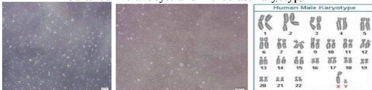
Figure 2: Our observation showed normal 45XY karyotypes in this patient, with no evidence of abnormality.