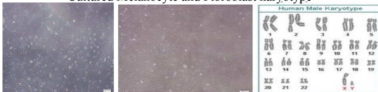
Figure 2: Our observation showed normal 45XY karyotypes in this patient, with no evidence of abnormality.