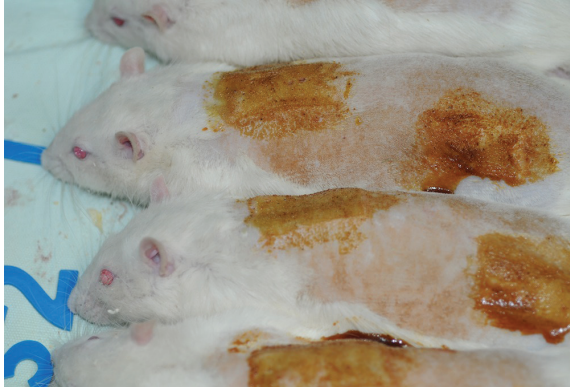
Fig. 1: 3 rd degree burn over upper back and 2 nd degree burn over lower back in 2 nd session.

Histological criteria was defined as following: for fibrosis (collagen bundles): normal bundle: 2, disorganized/edematous: 1, and amorphous: 0. For PMN, 40x field: 0-10: 2, 11-40: 1, >40: 0. Angiogenesis in 3 degree: mild, moderate and severe. Epithelialization was expressed as positive and negative.