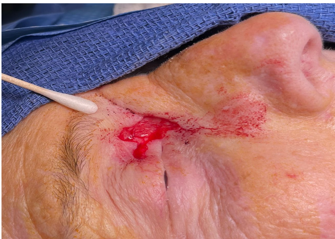
Figure 2: Intraoperative removal of scar tissue.

Regional flaps may be further broken down into different categories: Rhomboid flap 9 , Bilobed Rotational flap 10 , Paramedian Forehead Flap 11 , and V to Y flap 12 . Like the name suggests, a rhomboid flap uses a rhomboid shape for the transposition process. A bilobed rotational flap utilizes a similar technique in which a bilobed area of skin is transposed in a clockwise/counterclockwise manner, replacing the transected skin. A paramedian forehead flap utilizes a portion of the forehead skin to replace affected tissue. After healing, there is often some excess skin and adipose tissue in the repaired area; therefore, the healed area is often again surgically corrected to provide better cosmetic outcomes. A V to Y flap involves created a "V" shaped flap that is pulled away from the excision to cover another area; final suturing results in a "Y" shaped area, hence the