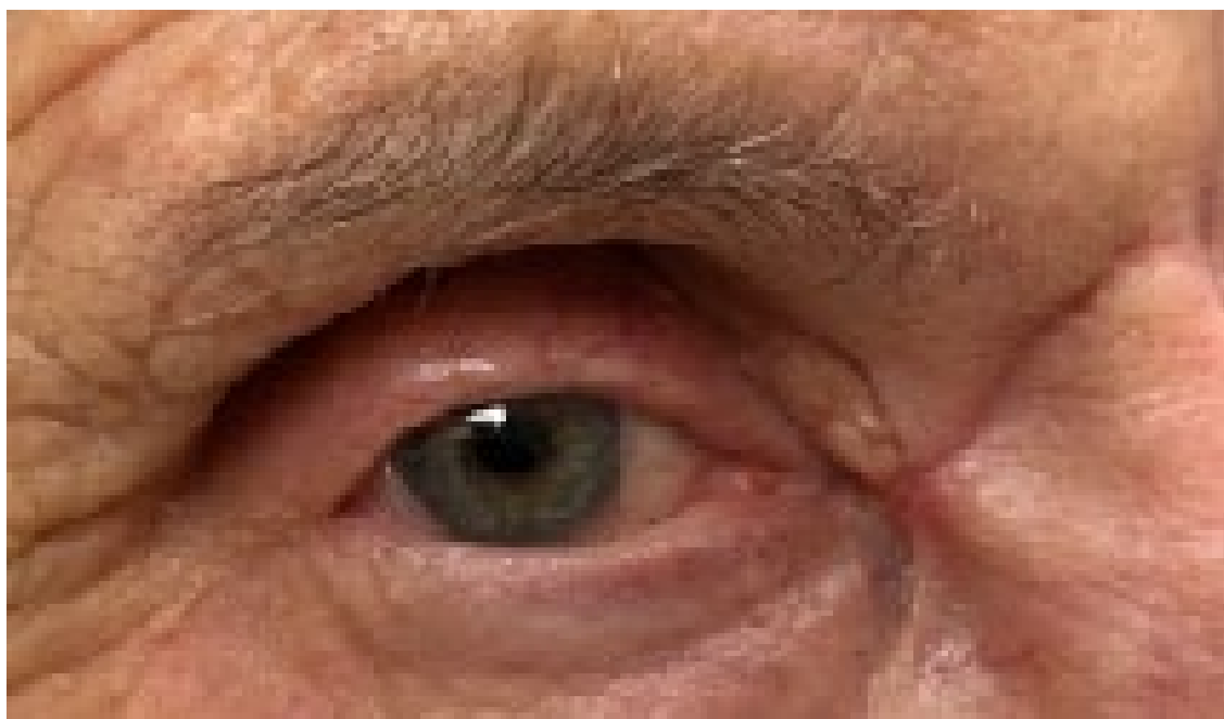
Figure 3: 3-month postoperative follow-up. Patient is able to sustain eye opening

name. While these are effective techniques in their own regards and have been used previously, they seemed less applicable given the patient described in the case. If a flap technique is used for medial canthus repair, it is recommended that it comes from an area of skin that matches in terms of texture, thickness, and color. Skin from the eyelids is often an excellent match for use in revision; however, this may confer the risk of contracture or subsequent limitations in mobility for the patient 13 . Median forehead flaps confer the risk of changing the medial brow position 13 .