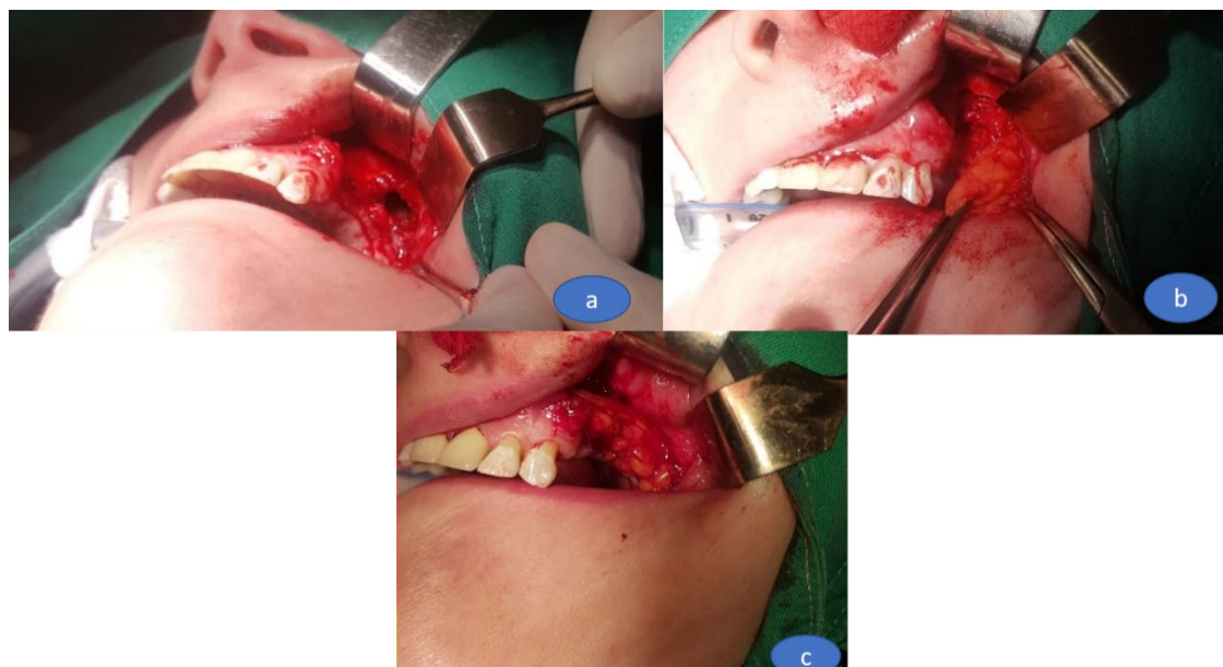
Figure 2: Intraoperative aspect of the oro-antral communication. Visualization and suture of the Bichat fat pad flap

prescribed and daily hygiene of the oral wound was performed. No local or general complications occurred and local healing was optimal without any inflammation or dehiscencies, with complete epithelization of the buccal fat pad flap.