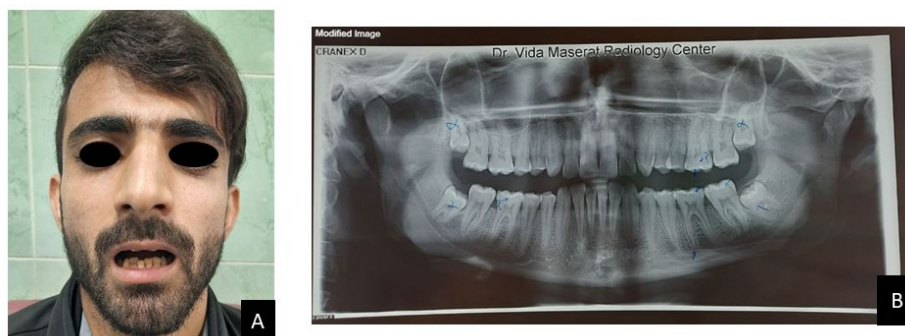
Figure 1: A: Decreased mouth opening in oral submucous fibrosis patient; B: radiographic view of the patient

To expand the range of the lateral motion of jaws and increase MIO, the coronoid processes were approached through the same incision, and a coronoid ectomy on the right side and coronoidotomy on the left side were performed. Then, bilateral dissection was carried out on the initial incision line to reach the buccinators and orbicularis oris muscle then the fibrotomy procedure was performed on both sides. The buccal fat pad was harvested through the posterior-superior margin of the incision and was used to completely cover the defect to prevent secondary epithelization. After the aforesaid bilateral actions, to prevent dead space, and biting and displacing the buccal fat pad flap, Tetracycline 1 % ophthalmic ointment was applied on a pair of small bandages and placed on the bilateral buccal