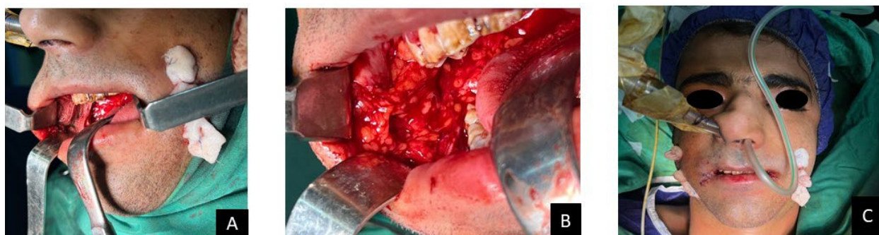
Figure 2: A: Harvesting of buccal fat pad; B: BFP sutured intraorally over the defect C: After the surgery with NG tube