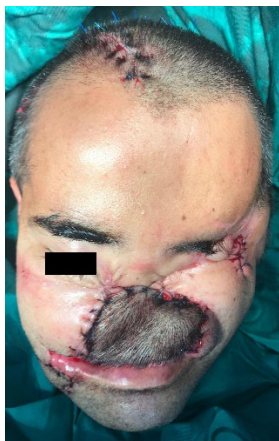
Figure 3b: Upper lip reconstruction