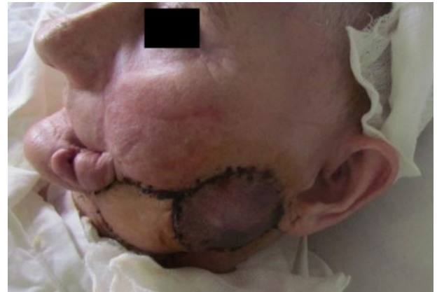
Figure 5: Flap congestion