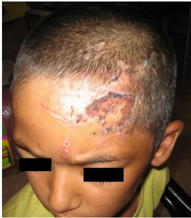
Figure 3a: Temporoparietal fascia with skin graft is used to cover traumatic avulsion in frontal region