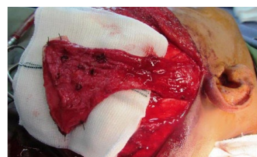
Figure 1c: Types of TPF based on composition c) Osteo-fascia