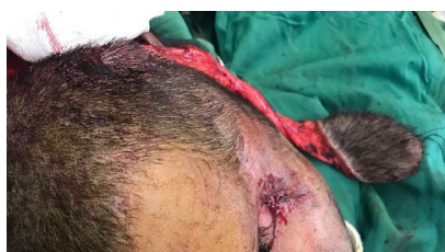
Figure 1b: Types of TPF based on composition b) Fascio-cutaneous