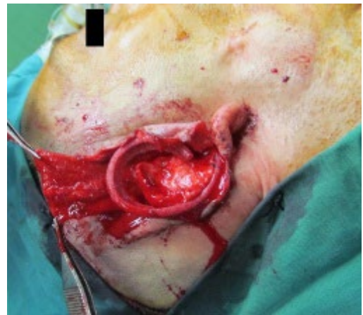
Figure 6: Temporoparietal fascia flap for auricle reconstruction