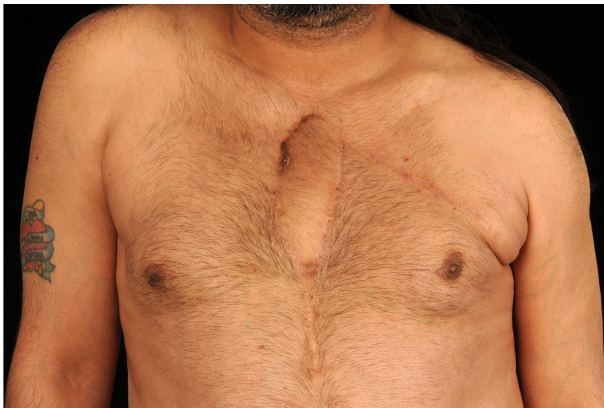
Figure 1: Eight months post-op image of the IMAP flap based on the lateral thoracic vessel, being perfused via the vascular aquifer.

The IMAP flap was first described in 2006 2 and has evolved from the deltopectoral flap based on advances in perforator know-how 3 . While these vascular channels may not in their virgin state, act as a source vessel to sustain a flap of tissue via a perforating vessel, if inadvertently delayed after surgery, this network could enlarge to a sufficient size to collectively perfuse a zone of tissue via an overlying perforator which acts as an 'artesian well' to the deeper vascular aquifer. This concept is graphically illustrated as follows in