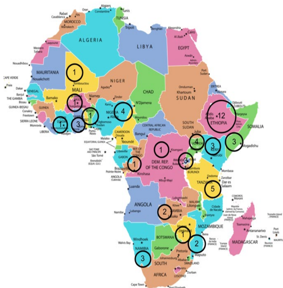
Figure 2: Geographical distribution of surgeons who responded to the survey.

cancellations and delays. Moreover, all surgeons were convinced that the pandemic has deterred patients from seeking medical care at the hospital (Table 1b).