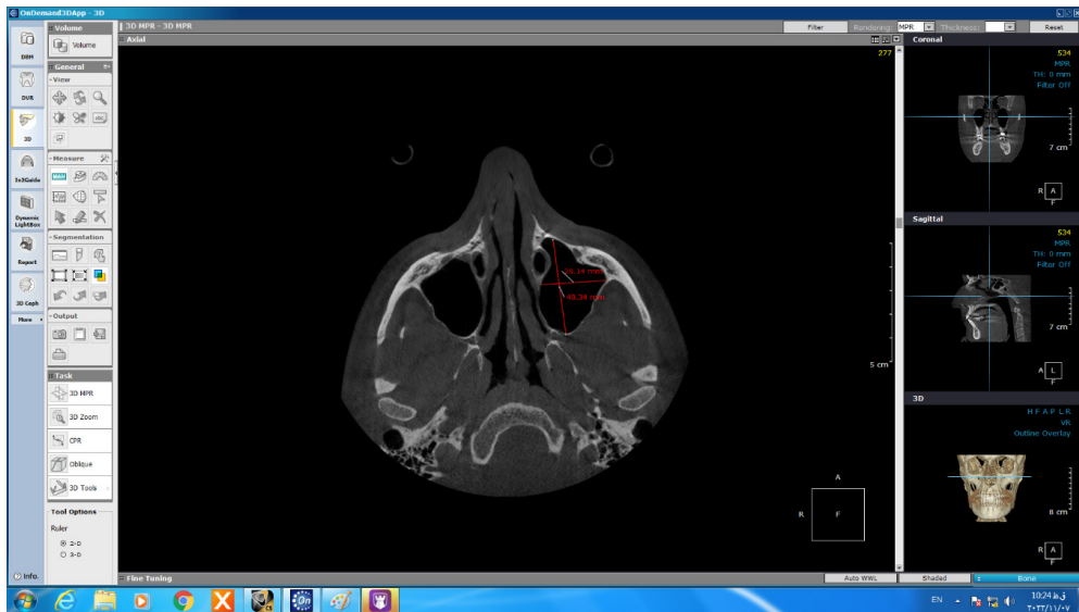
Fig. 3. Measurement of mediolateral and anterior posterior dimension of maxillary sinus