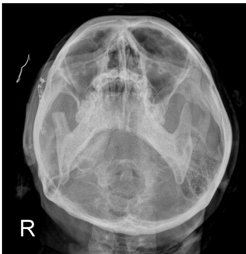
Figure 4: post-operation radiography that revealed the absence of right side coronoid