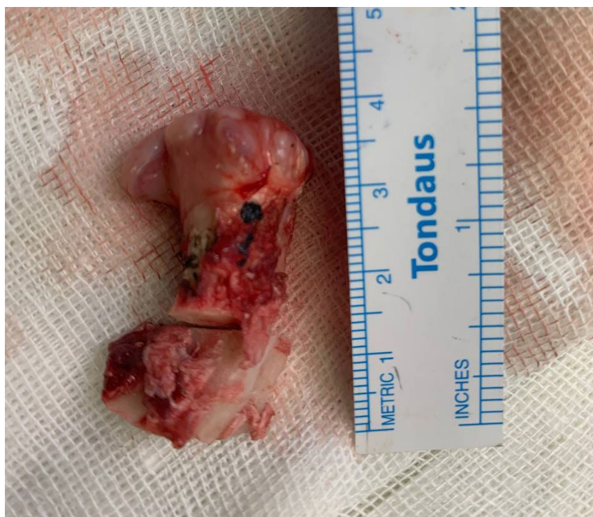
Figure 3: The gross surgical specimen around 4.0 X 2.0 cm, which was white in color, smooth surfaced and hard in consistency