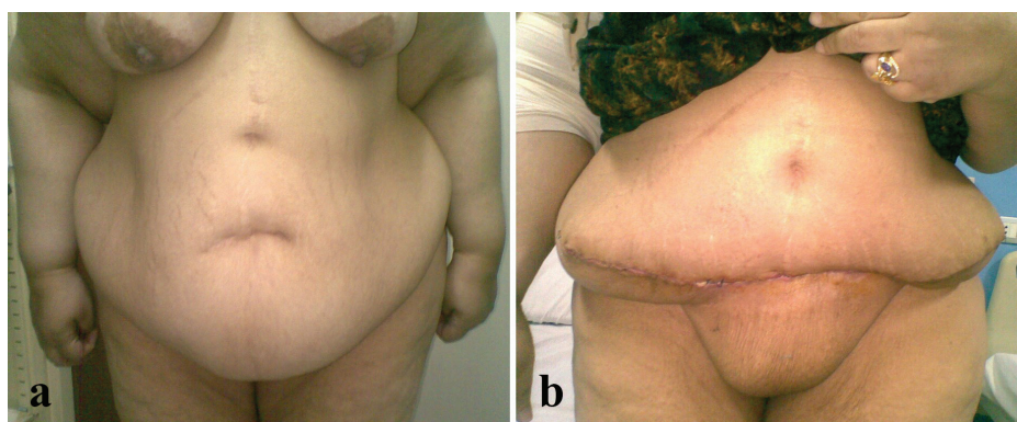
Fig. 6a, b: Preoperative and postoperative picture of abdominoplasty case with BMI >30 kg/m 2 .

sutures and two suction drains were exteriorized. The wound was closed (tension free) in two layers, vicryl 3-0 stitches were applied to fix the scarpa's fascia of the superior abdominal flap to the inferior scarpa fascia border.