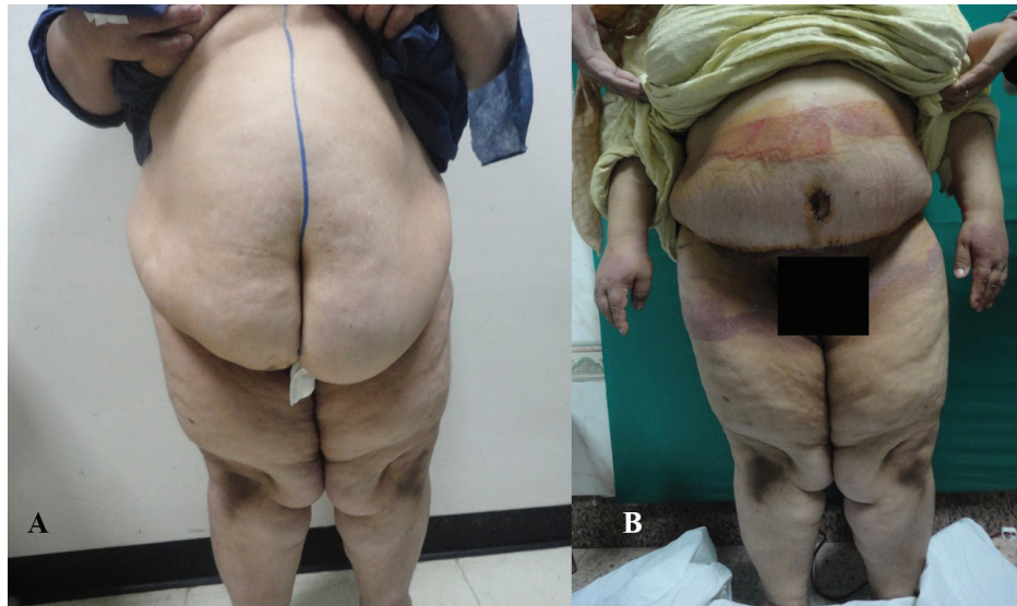
Fig. 3a, b: Preoperative and postoperative picture of abdominoplasty case with BMI >30 kg/m 2 .