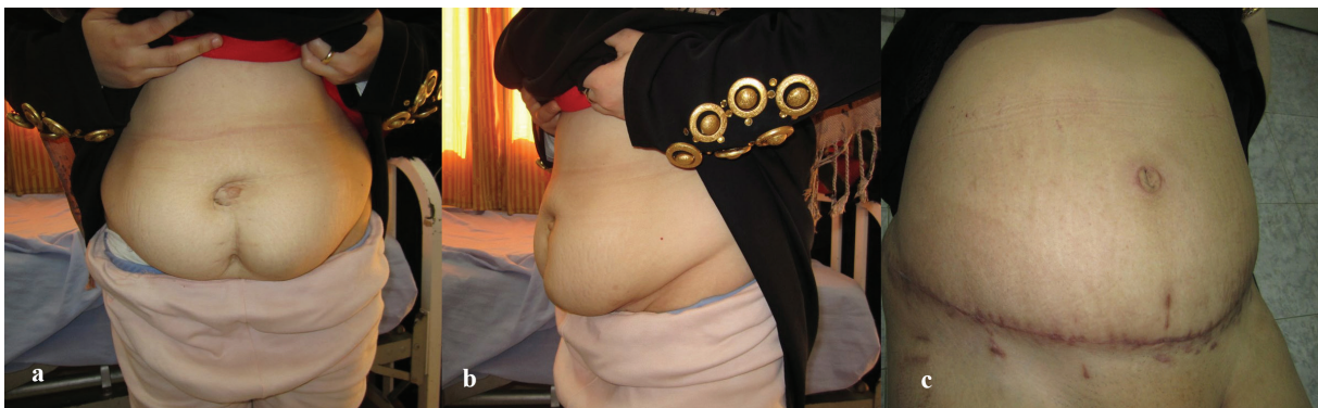
Fig. 2a, b, c: Preoperative and postoperative picture of abdominoplasty case with BMI <30 kg/m 2 .