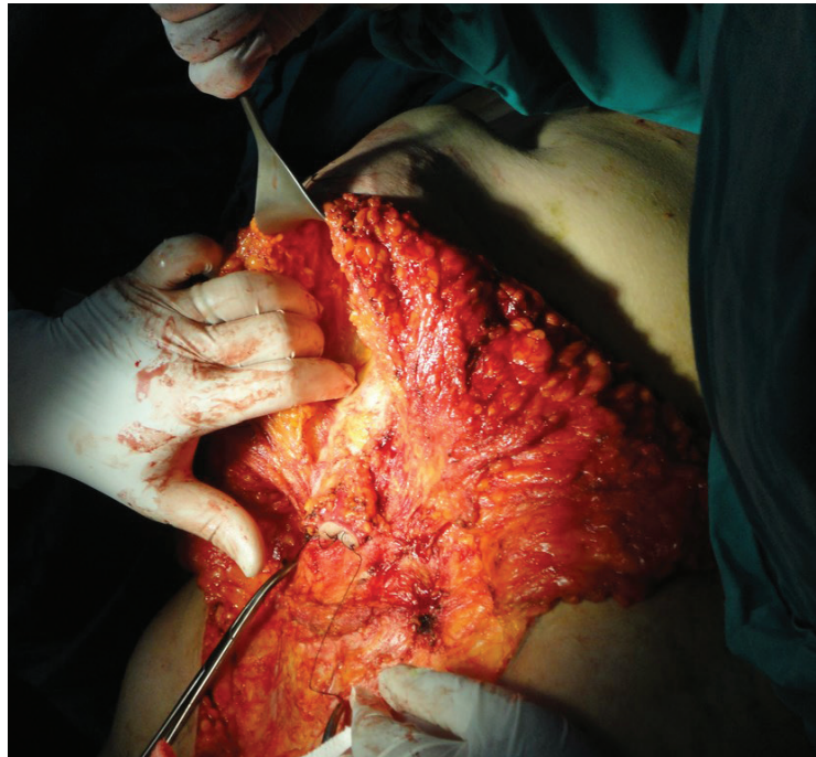
Fig. 7: Dissection of the umbilicus from the flap.