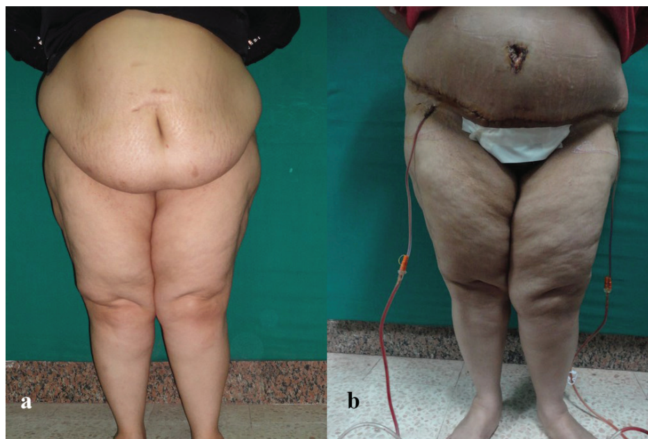
Fig. 4a, b: Preoperative and postoperative picture of abdominoplasty case with BMI >30 kg/m 2 .

Preoperative markings were crucial to successful surgery and to get desired symmetrical results. Patients were marked preoperatively in the standing position, and a transverse line was made just above the pubic hair extending laterally 7 to 18 cm in each direction towards the anterior superior iliac spine. Skin incision following the previously determined markings at the lower abdomen was done, sometimes a vertical incision from the umbilicus to the pubis was added to facilitate dissection. The umbilical scar was isolated (Figure 7) and dissection of the deep tissues was performed with electro cautery. Below