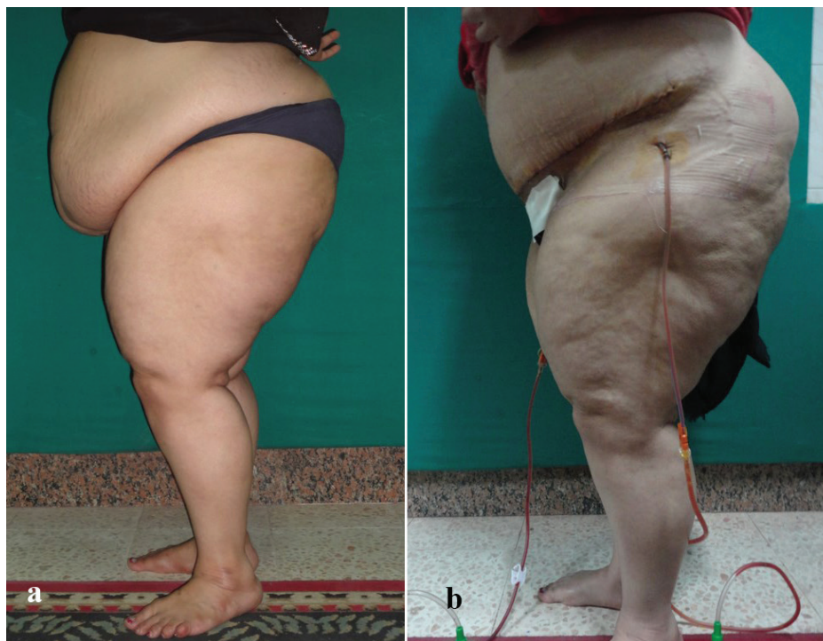
Fig. 5a, b: Preoperative and postoperative picture of abdominoplasty case with BMI >30 kg/m 2 .