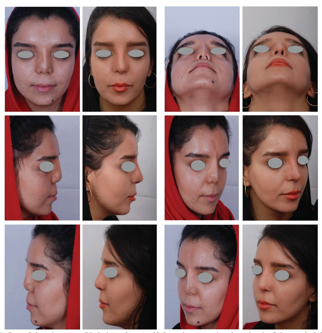
Fig. 3: Case of ultra-short nose (Binder's syndrome) with 3 previous operations in each pair of pictures the left one is pre-op and the right one is post-op. Results (8 months post-op) after nasal augmentation with grated cartilage + fascia from rib cartilage and rectus abdominis fascia and other different grafts for all parts of the nose. We have also used grated cartilage + fascia for augmentation of deficient nasal base and lower rim of piriform aperture.