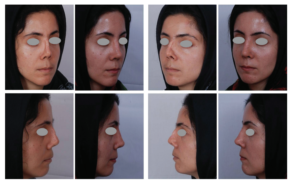
Fig. 4: Deformed tertiary nose after 3 previous rhinoplasties, bone and cartilage graft. Result after 10 months: Lengthening and multiple grafting from autologous rib cartilage and grated cartilage graft + fascia.

be degloved easily during the surgery and allows safe dissection. Intraoperative skin damage and tearing would be significantly reduced especially in those patients who have undergone multiple rhinoplasties. Secondly, it seems that blood supply of the skin has been increased dramatically due to continuous massage therapy and skin ischemia and necrosis are less frequently seen in these patients.