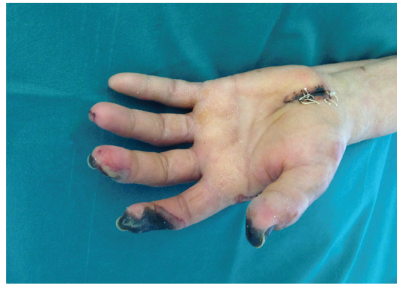
Fig 3: Preoperative left hand clinical situation: the vascular occlusion caused the necrosis of the first three fingers and the skin of the surgical wound.

Post-traumatic compression of neurovascular structures between the clavicle and the first rib have been described in the literature. 3 A case of undiagnosed TOS, complicated by acute ischemia of the upper arm after surgical treatment for CTS in a 68-year-old woman, is described here. However, in our patient, the original diagnosis of CTS may have been correct. Proximal anatomic abnormalities may in fact increase the susceptibility of peripheral nerves, resulting in symptoms such as peripheral compression of the