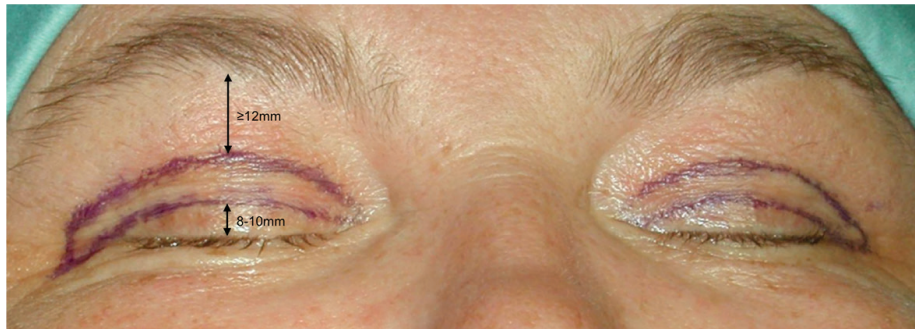
Fig. 2: The lower incision line is placed in the supratarsal crease 8-10mm cephalad to the upper lid margin. After performing a pinch test the superior incision line is marked. The distance from the upper incision line to the lower brow margin should be at least 12mm.