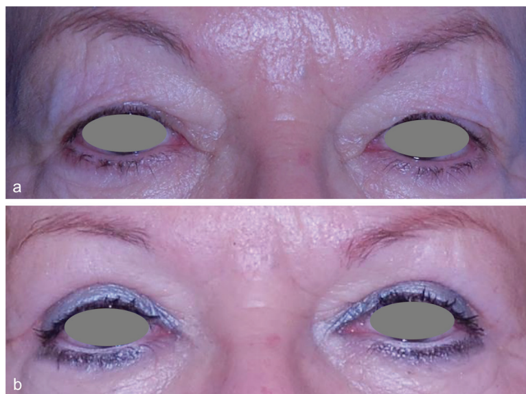
Fig. 1: a) Pre- and b) postoperative view of a representative patient that underwent upper blepharoplasty.

Notable differences in the eyelids of Asians