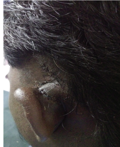
Fig. 6: Healed wound after 1 week with good cosmesis.

The versatile rhomboid flap was first described by Professor Limberg in 1928. 10 It is a parallelogram with two angles of 120° and two of 60° which can be modified as per the size of the