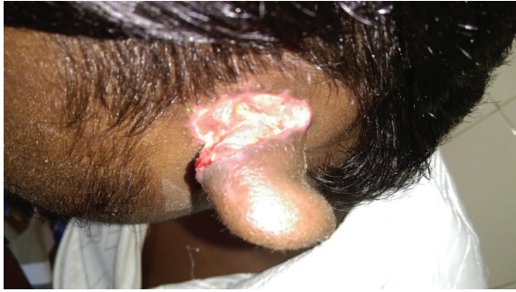
Fig. 1: Infected raw area with slough.

intravenous antibiotics and underwent a primary debridement and sloughectomy. Infection was progressively controlled with antibiotics and the raw area granulated (Figure 2).