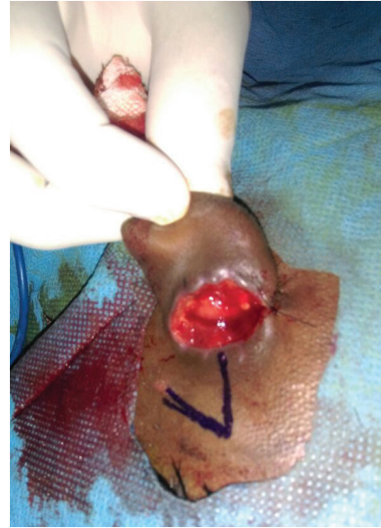
Fig. 3: Raw area prepared into a rhomboid.

The traumatic external ear poses a challenge to the reconstructive surgeon. The protruded configuration and the presence of cartilage sandwiched between the skin makes it vulnerable to traumatic injuries and post traumatic infections. The usual mode of injuries are bite injuries, injuries in sportspersons, road traffic