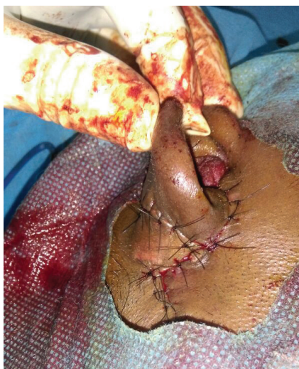
Fig. 5: Post flap transposition.

anatomical repair of the pinna as well as to provide acceptable cosmesis at the same time. Various techniques and methods have been described by authors highlighting the successful repair of traumatic injuries of pinna. Singh et al. described the use of doubled-over Limberg flap in reconstruction of ear lobule in 6 patients. 3 Chattopadhyay et al. demonstrated the Gavello flap technique from post auricular mastoid region in ear lobule reconstruction in 3 patients. 4 In the large volume study of 105 patients requiring post traumatic reconstruction by Kolodzynski et al. , 1 apart from the use of costal cartilage for reconstruction in 53 patients, the skin cover for the pinna was provided using skin pockets in 53 patients, post auricular flap in 21 patients, tissue expansion in 12 and temporoparietal fascia flap in 12 patients.