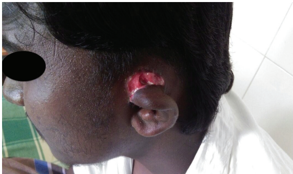
Fig. 2: Granulated raw area after antibiotics and sloughectomy.

intravenous antibiotics and underwent a primary debridement and sloughectomy. Infection was progressively controlled with antibiotics and the raw area granulated (Figure 2).