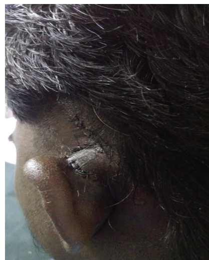
Fig. 6: Healed wound after 1 week with good cosmesis.

The versatile rhomboid flap was first described by Professor Limberg in 1928. 10 It is a parallelogram with two angles of 120° and two of 60° which can be modified as per the size of the