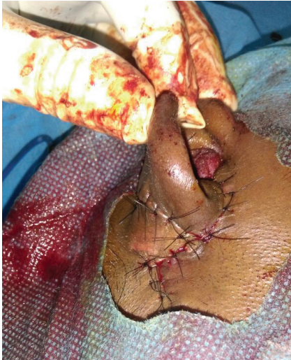
Fig. 5: Post flap transposition.

anatomical repair of the pinna as well as to provide acceptable cosmesis at the same time. Various techniques and methods have been described by authors highlighting the successful repair of traumatic injuries of pinna. Singh et al. described the use of doubled-over Limberg flap in reconstruction of ear lobule in 6 patients. 3 Chattopadhyay et al. demonstrated the Gavello flap technique from post auricular mastoid region in ear lobule reconstruction in 3 patients. 4 In the large volume study of 105 patients requiring post traumatic reconstruction by Kolodzynski et al. , 1 apart from the use of costal cartilage for reconstruction in 53 patients, the skin cover for the pinna was provided using skin pockets in 53 patients, post auricular flap in 21 patients, tissue expansion in 12 and temporoparietal fascia flap in 12 patients.